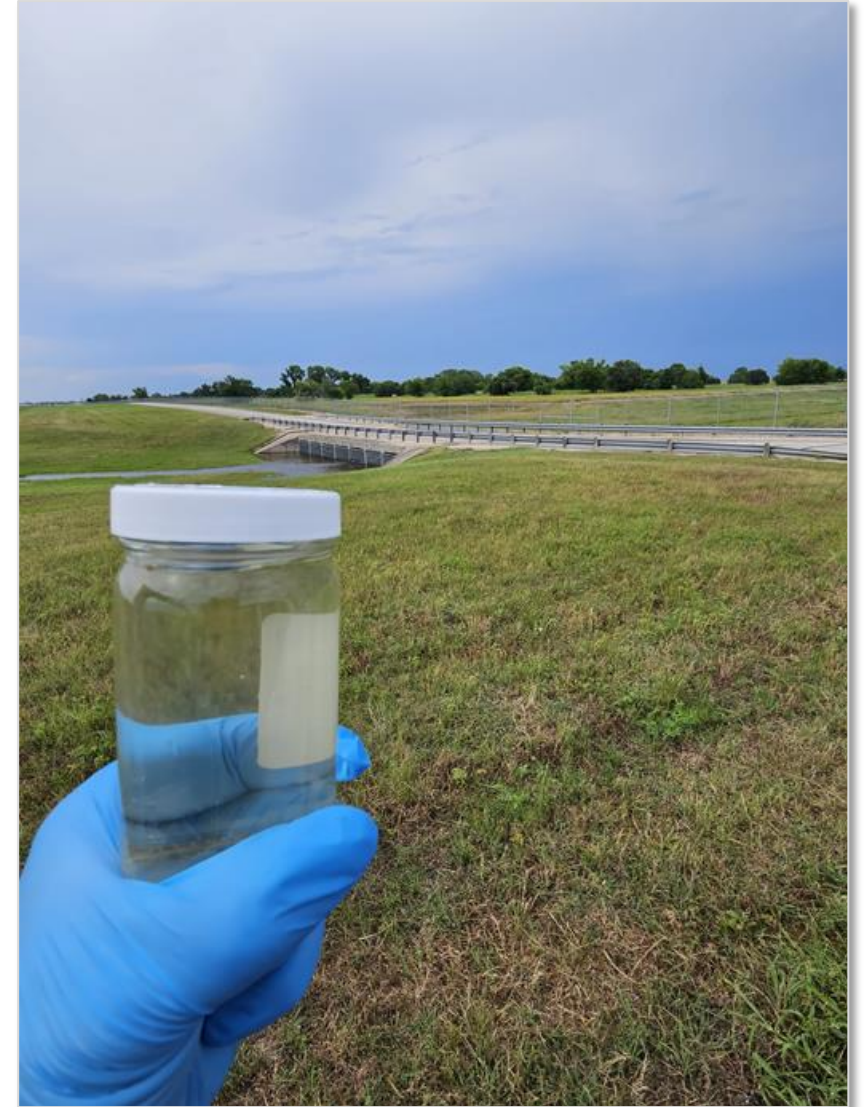
Storm water sample 6/5/2023