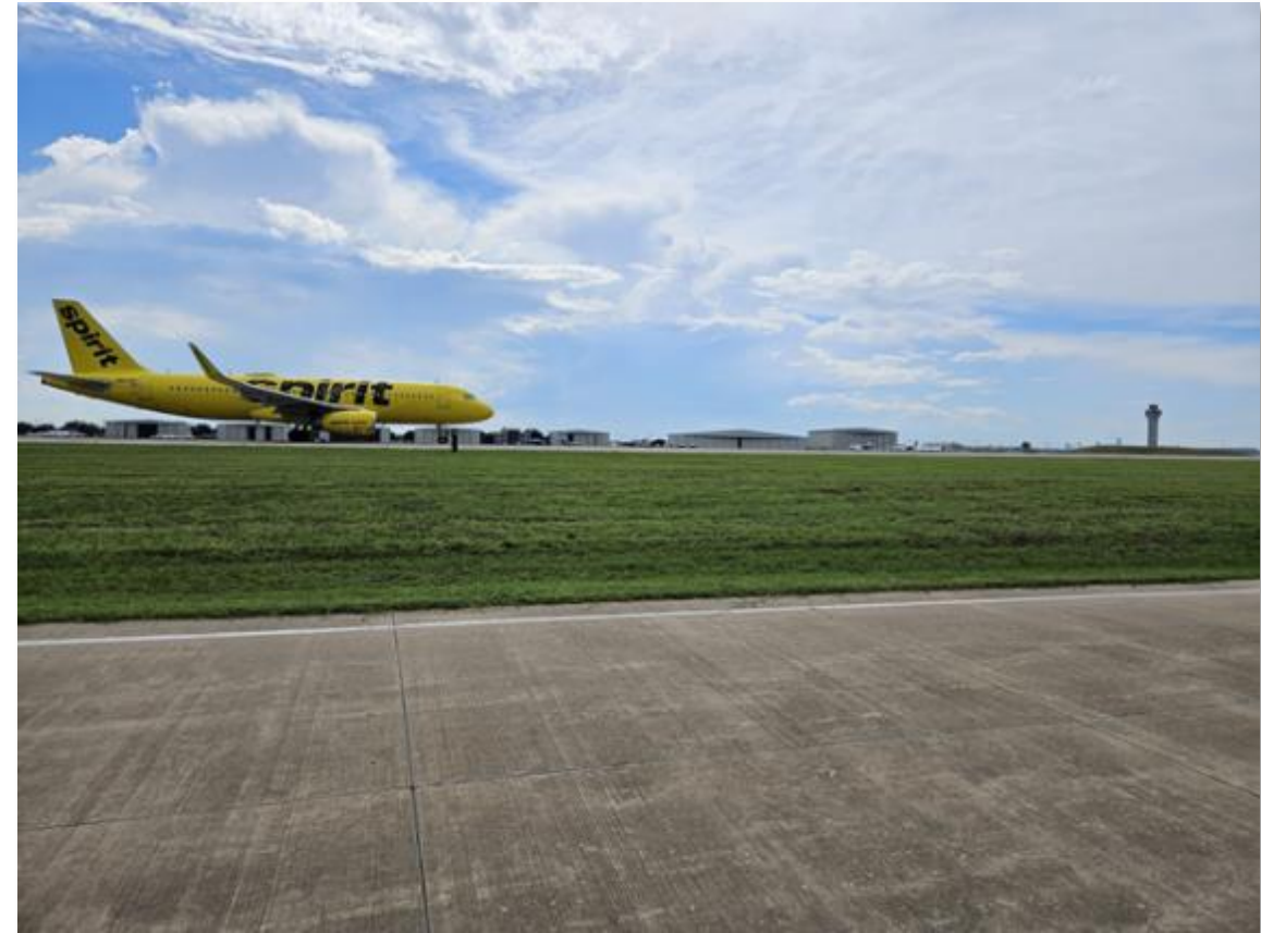
Vegetative Filter Strip