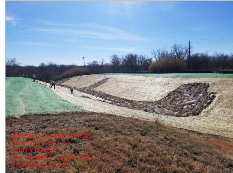
CIP Drainage Improvement Project (2018): Outfall 13 Erosion Repair and Stabilization Project (before and after photos)