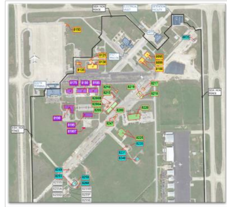
AEDP Building Demolition Projects