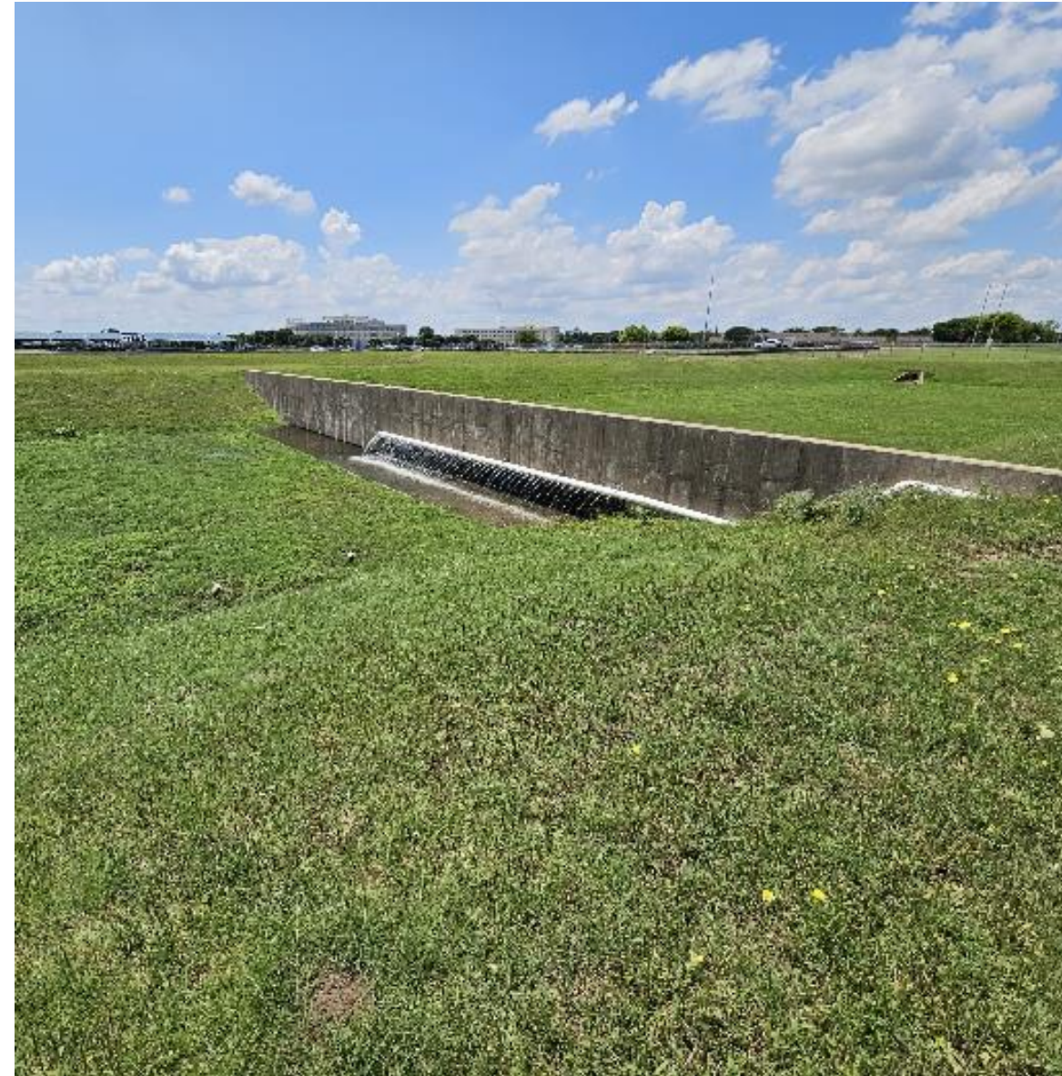
Cargo Apron Water Quality Pond