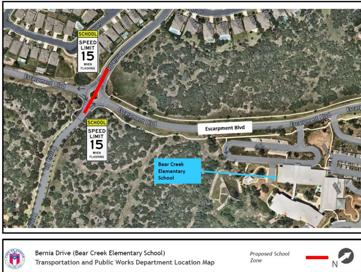
Figure 3: Proposed School Zone on Bernia Drive