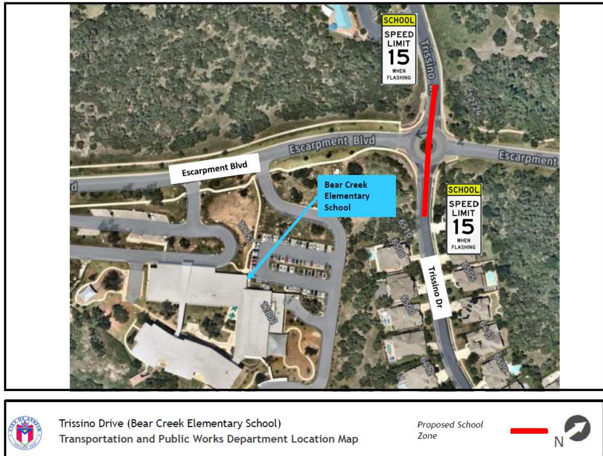
Figure 2: Proposed School Zone on Trissino Drive