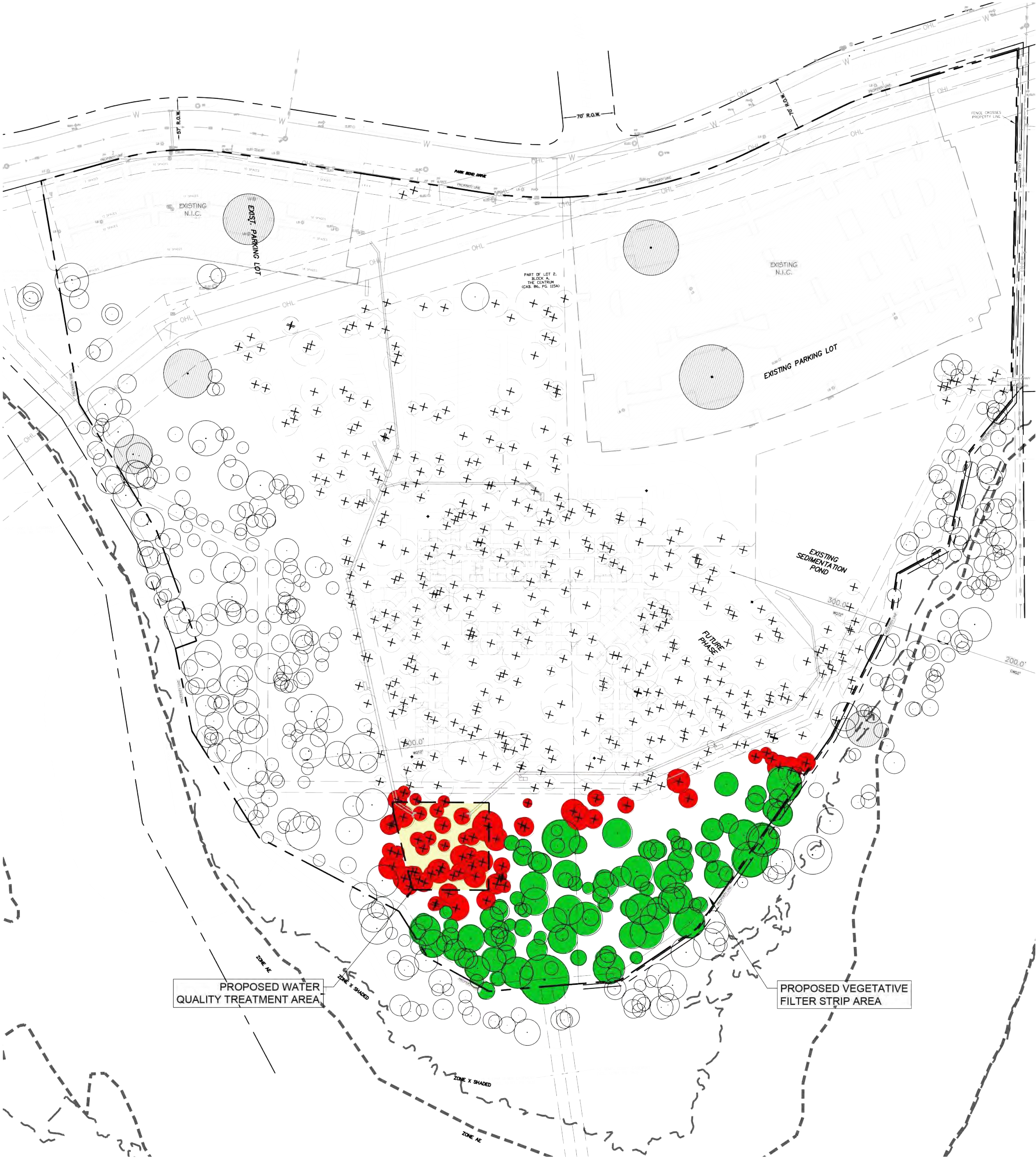
2 TREE PRESERVATION WITH VEGETATIVE FILTER STRIP - PER UPDATED PUD REQUEST NTS