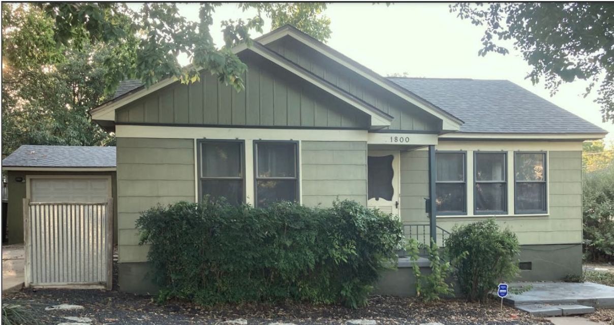
Demolition permit application, 2023