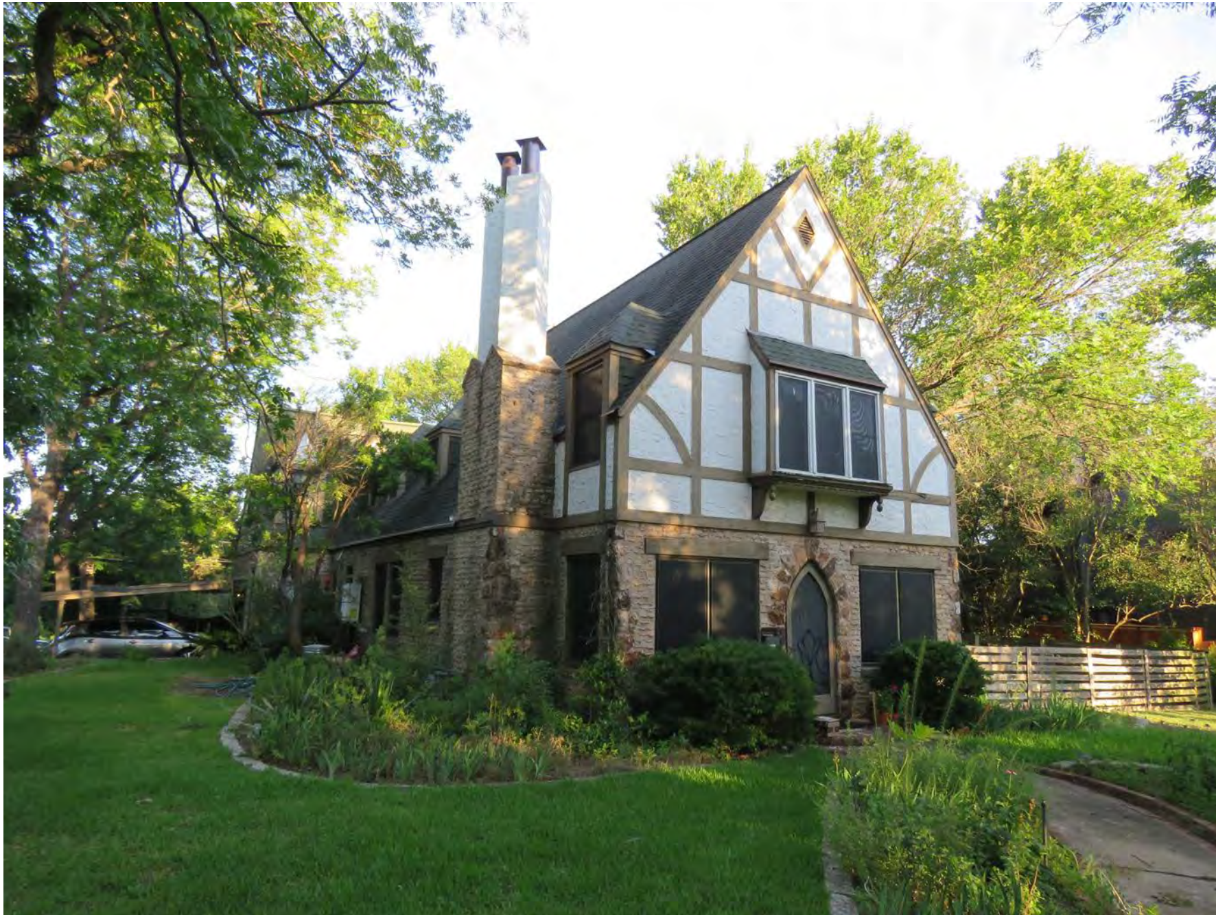
Burks-Challstrom House 2101 Travis Heights Blvd. Austin, Texas 78704