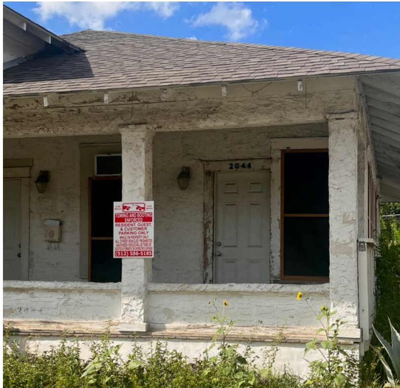
Demolition permit application, 2023