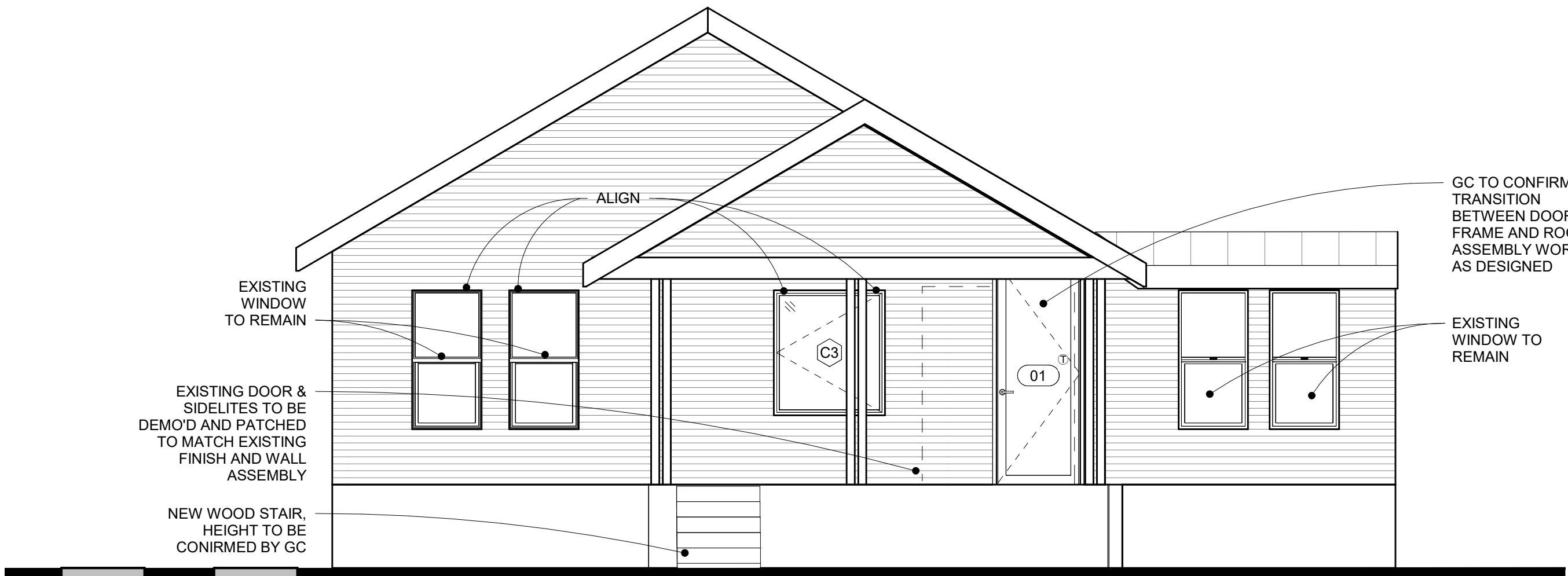
1 HOUSE - WEST ELEVATION 1/4" = 1'-0"