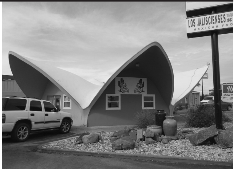
Taqueria Los Jaliscienses on US 290 East at Sheridan Avenue has a lotus-blossom roof, one of the more innovative and futuristic rooflines in Austin. The original windows for this Mid-Century Modern commercial building has had its windows replaced recently.

Mid-Century Modern architecture also reflected a new social philosophy in that the buildings strove to mesh the outside environment with interior living space. Large expanses of glass framed by thin structural members invited more contact with the outside, with the hope that residents would embrace a more active lifestyle if they were not hemmed in by solid walls that kept them from full appreciation and enjoyment of their surroundings. Open floor plans also promoted a more casual and integrated living experience in Mid-Century Modern homes – larger spaces could be used for a variety of purposes, rather than more traditional floor plans which designated certain rooms for particular activities. Modern construction techniques allowed architects to experiment with forms and materials. Steel framing, first used in Chicago skyscrapers at the turn of the century, was employed for Mid-Century