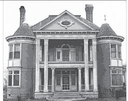
Commodore Perry Estate

S ave the date, May 29th, 2014, for this year's course on Buying and Selling Old Houses, to be held at the Ragsdale Center of St. Edward's University. The purpose of the course is to enable REALTORS® to enhance their effectiveness in serving clients who consider buying or selling old houses. This course is also open to homeowners who want to understand better their old house.