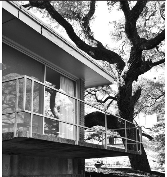
Thorne House, 3607 Balcones Dr.