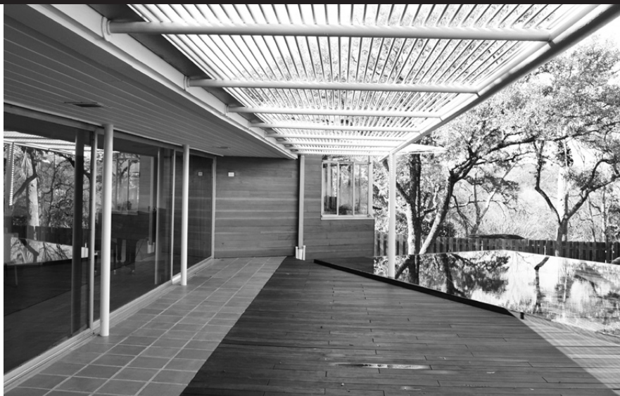
Fehr House, 5102 Ridge Oak Drive

Mercury Design Studio, Tarrytown Pharmacy, Urbanspace Interiors, and Zinger Hardware & General Merchant, or on day of event at all the featured homes (credit card sales only offered at 2603 La Ronde). $23 members / $28 non-members/ $23 Children 12 and under. To buy tickets or for more information on the tour, map, and FAQ, visit www.preservationaustin.org .