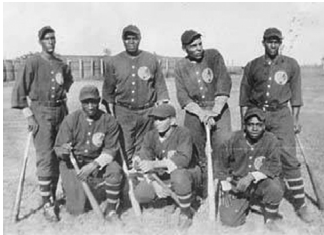
Austin's Black Senators, Austin's own Negro league team, played on historic Downs Field in East Austin.

For more information, visit www.aachd.org . ★