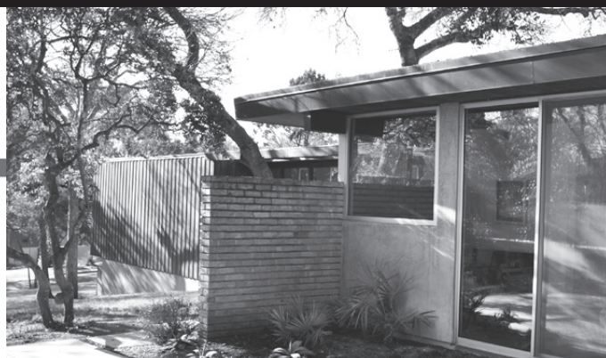
Dillard House, 4506 Crestway Drive

P reservation Austin proudly announces its 22nd annual Homes Tour to be held on April 5, 2014. This special tour will offer a snapshot of a transforming Austin, when Austin's first tech company Tracor made its initial public stock offering, a group of friends first gathered to celebrate Eeyore's Birthday Party, and a little honky-tonk named the Broken Spoke was built on the outskirts of town.