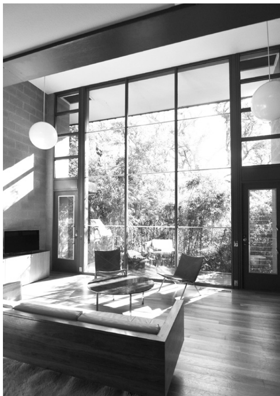
Cranfill-Beacham Apartments, 1911 Cliff Street