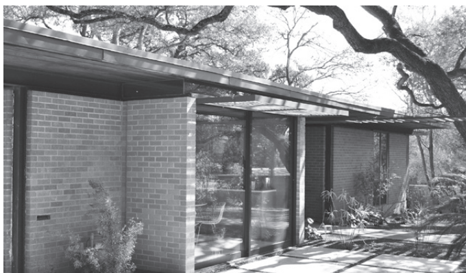
Crume House, 2603 La Ronde Street