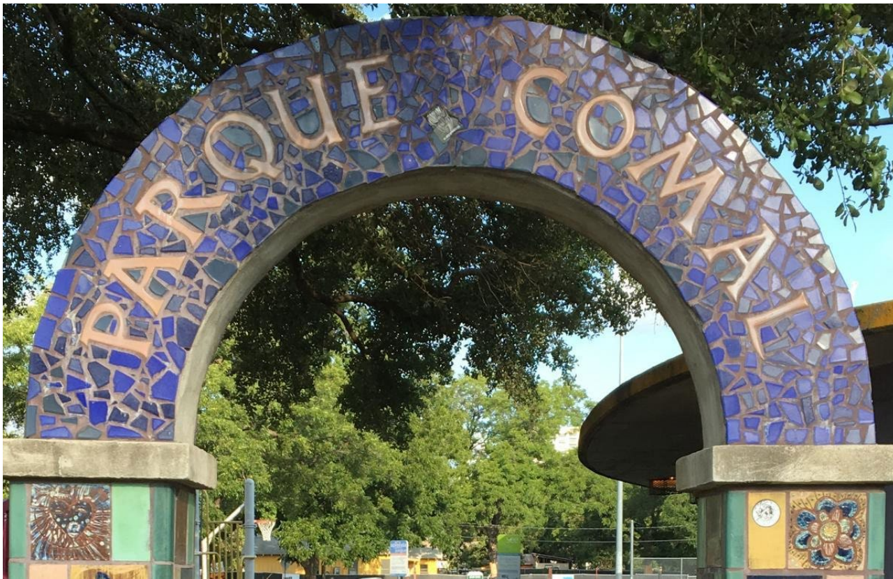
Dana Perrotti Final Design Review – Parque Comal