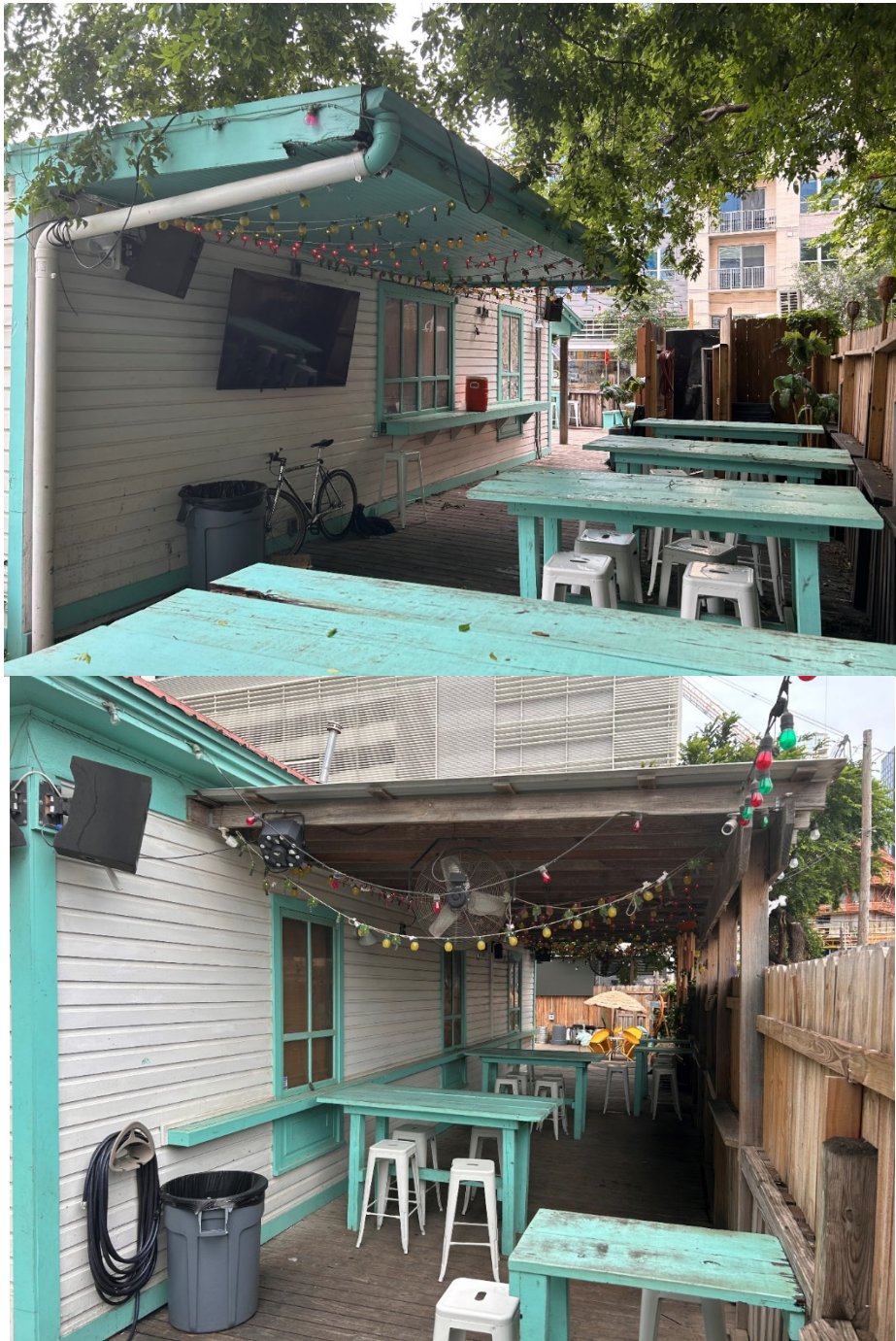
Demolition Permit Application – 2023