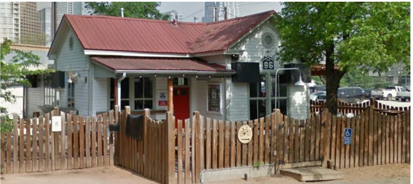
Google Maps, 2013