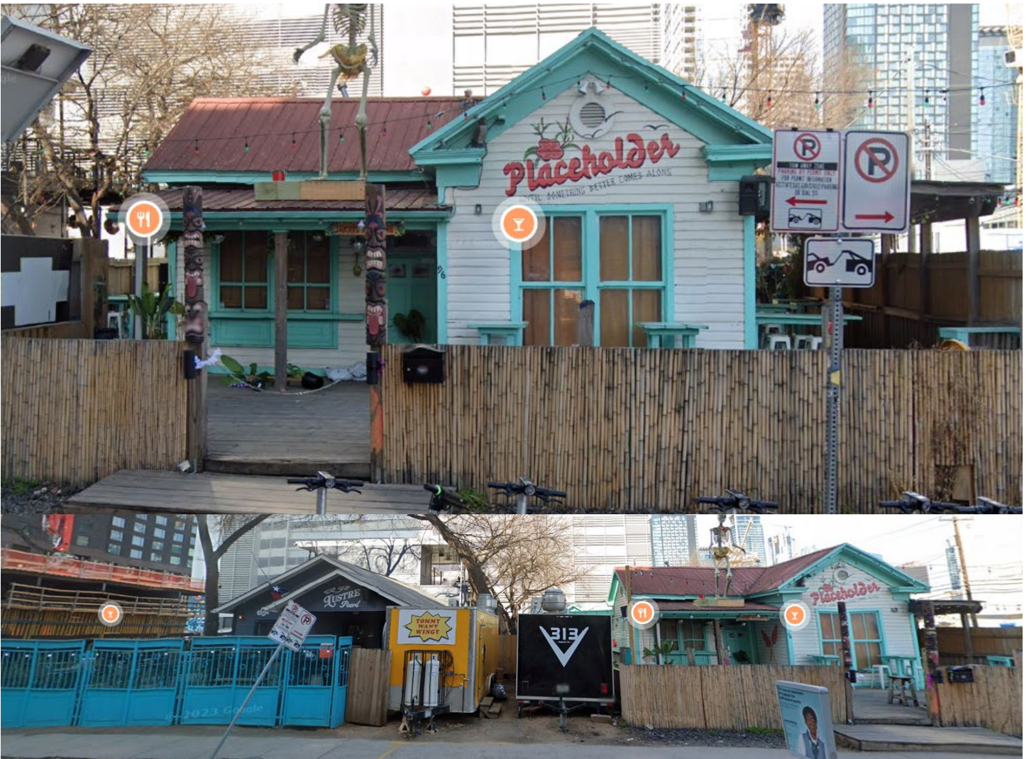
Google Maps, 2023