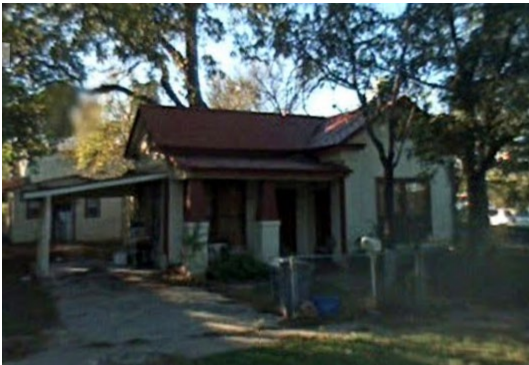
Google Maps, 2007