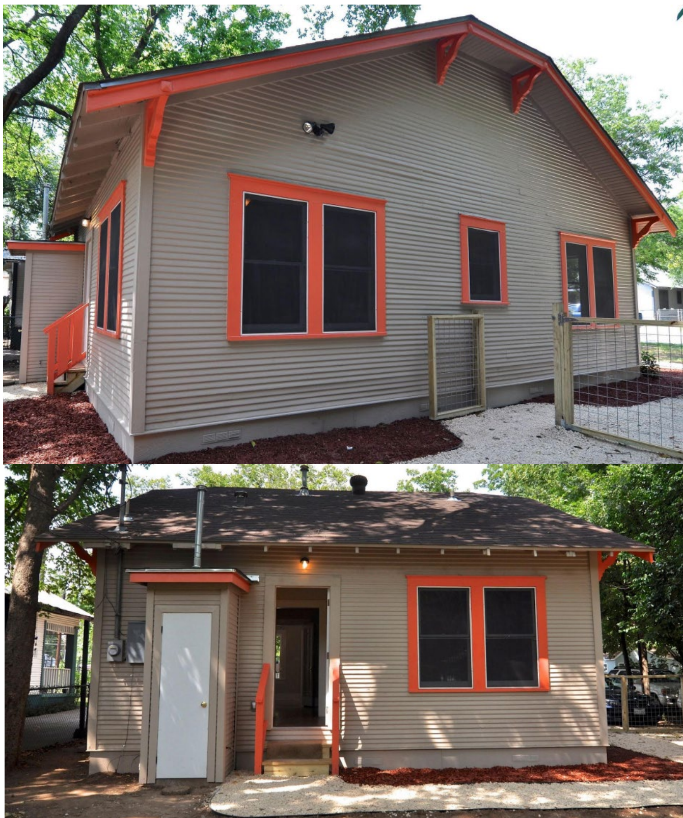
Relocation permit application, 2023