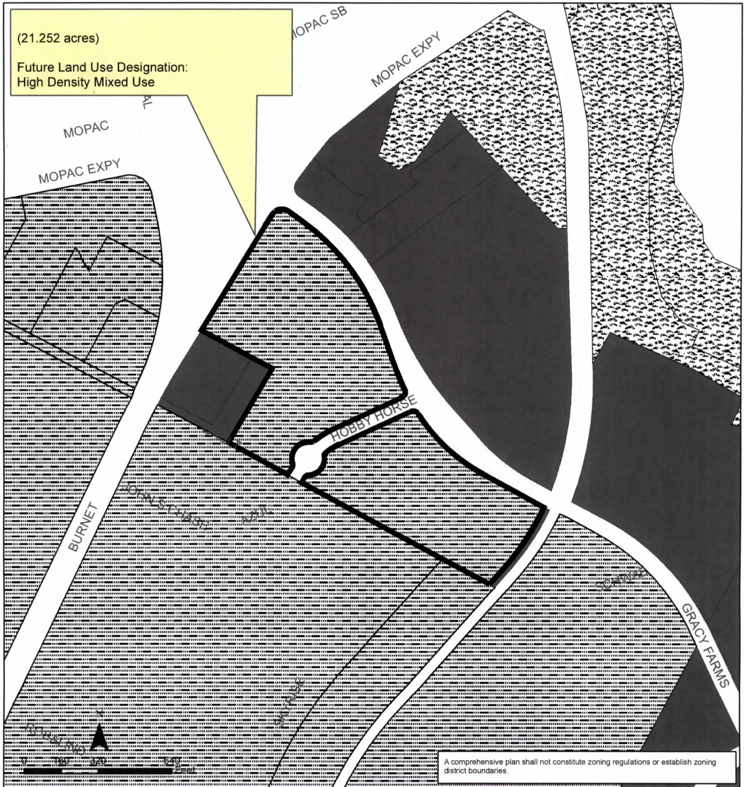
Exhibit A North Burnet/Gateway Combined Neighborhood Planning Area NPA-2023-0024.01

This product is for informational purposes and may not have been prepared for or be suitable for legal, engineering, or surveying purposes. It does not represent an on-the-ground survey and represents only the approximate relative location of property boundaries.