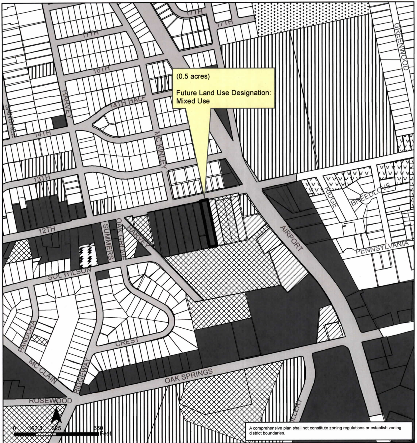
Exhibit A Rosewood Neighborhood Planning Area NPA-2022-0008.01

This product is for informational purposes and may not have been prepared for or be suitable for legal, engineering, or surveying purposes. It does not represent an on-the-ground survey and represents only the approximate relative location of property boundaries.