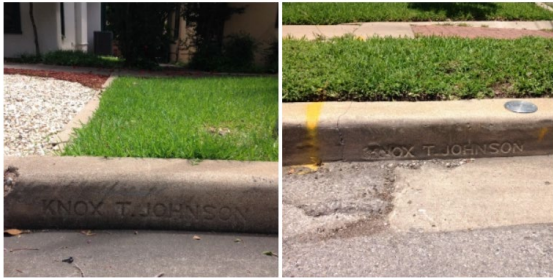
(Above left: 14th east of Nueces; right: Nueces north of 11th)