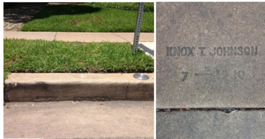
(Above left: near 11th and Rio Grande; center and right: Washington Square)