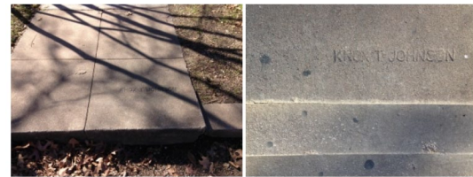
(Above left: Washington Square; right: steps on Lavaca at 15th)