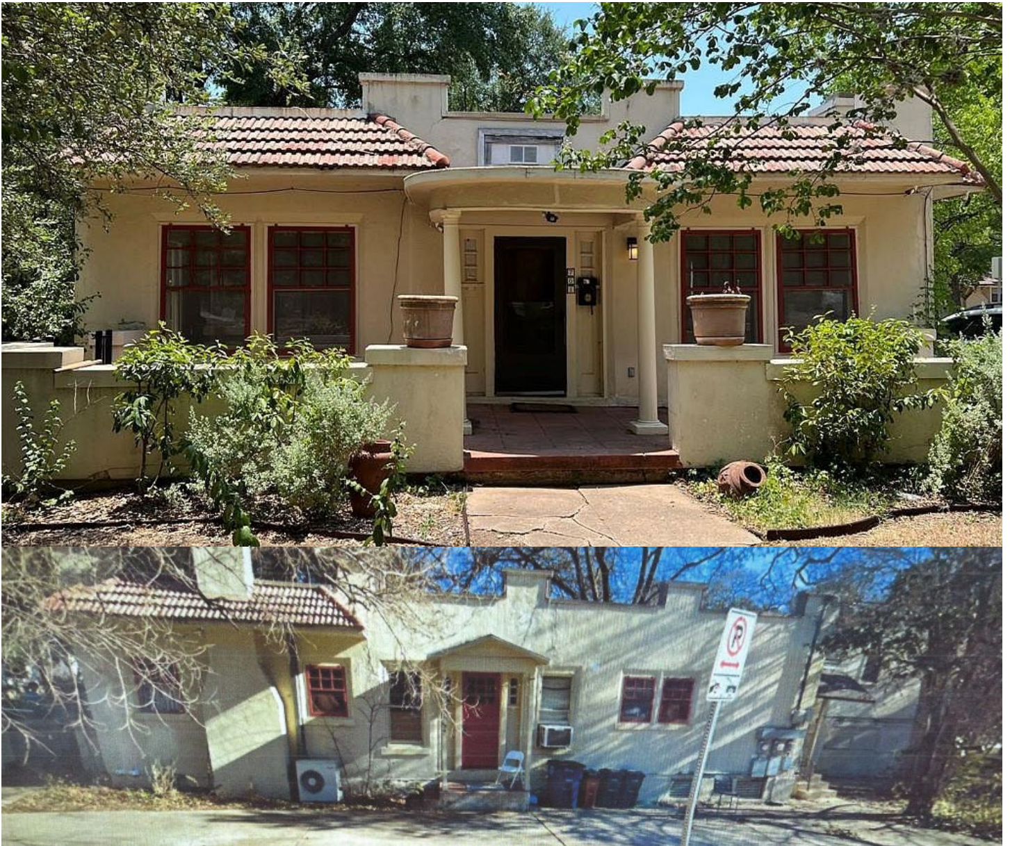
Demolition permit application, 2023