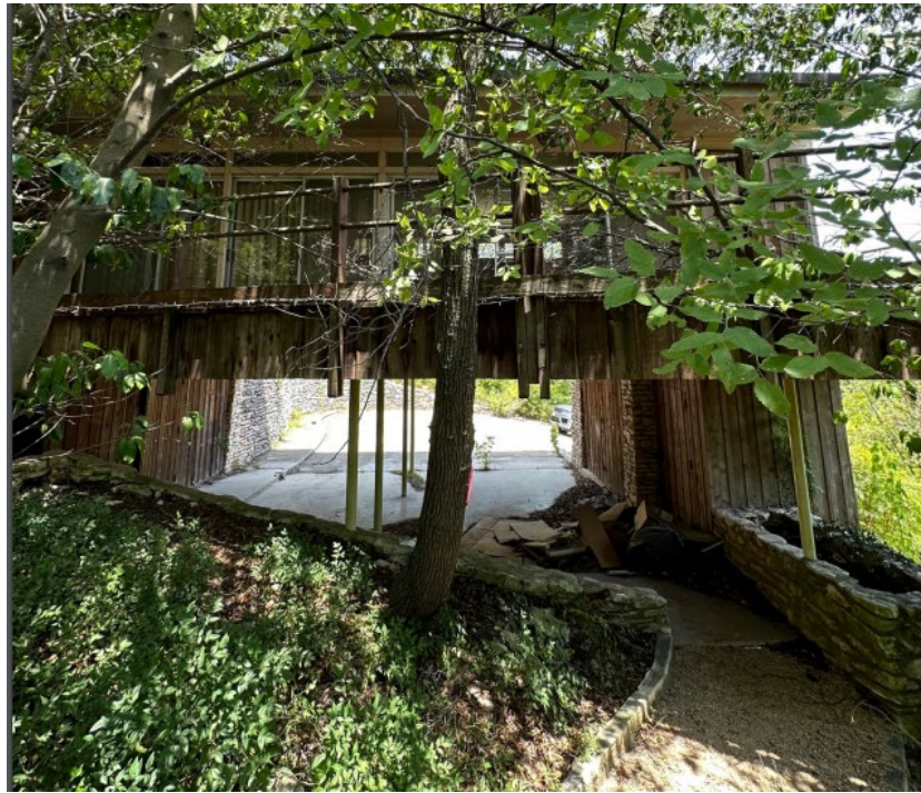
Demolition permit application, 2023

City directory research was not available for this property.