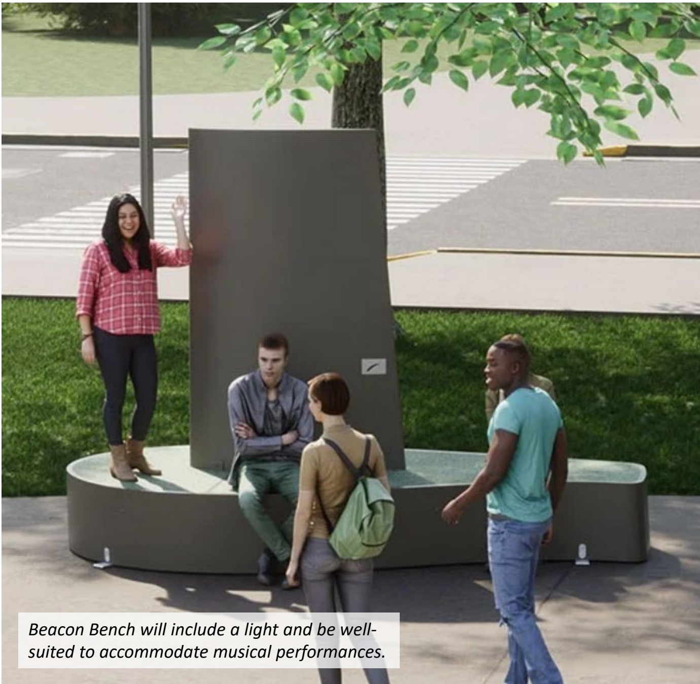
Beacon Bench will include a light and be well-suited to accommodate musical performances.