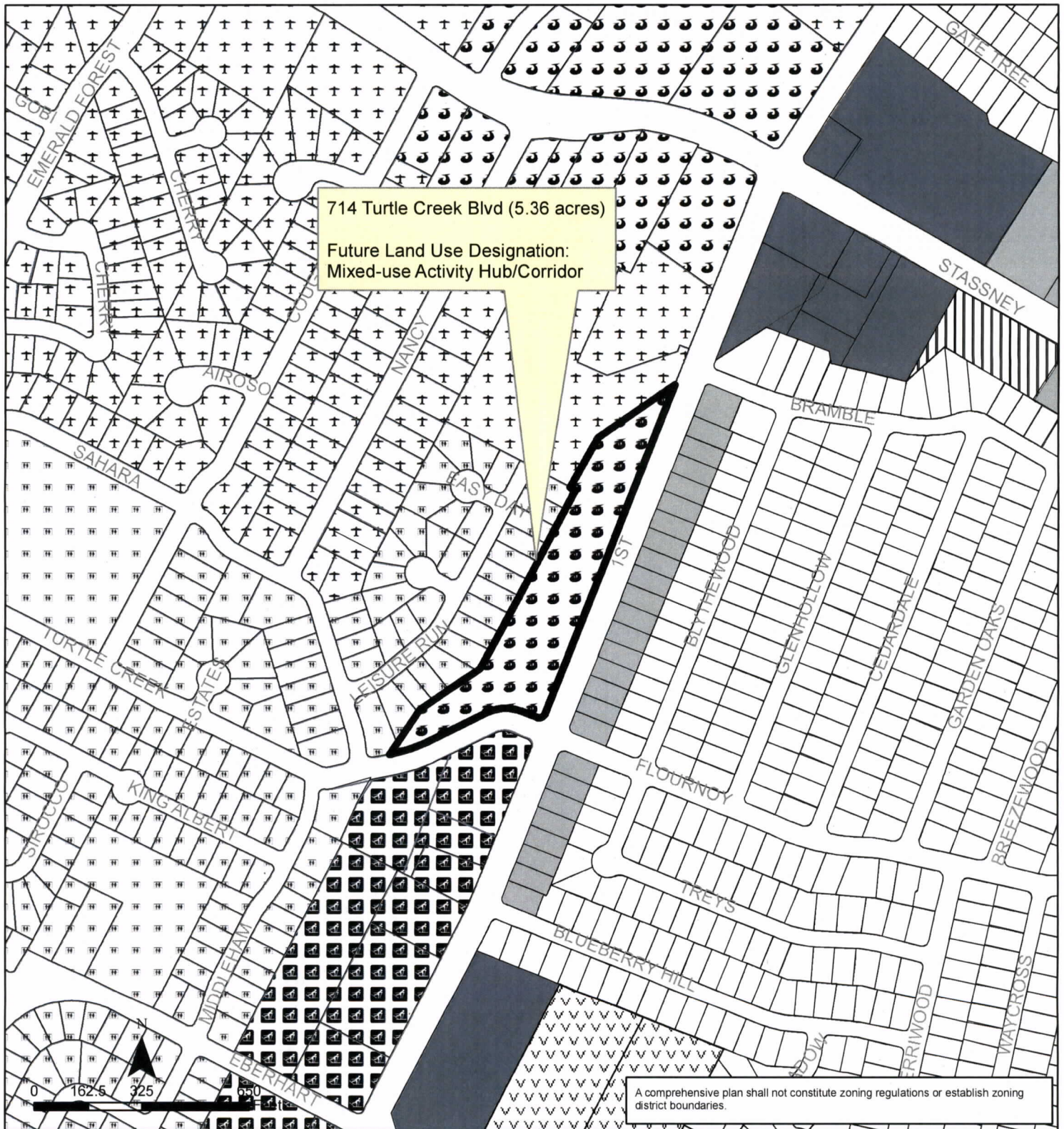
Exhibit A South Austin Combined Neighborhood Planning Area NPA-2023-0030.02

This product is for informational purposes and may not have been prepared for or be suitable for legal, engineering, or surveying purposes. It does not represent an on-the-ground survey and represents only the approximate relative location of property boundaries.