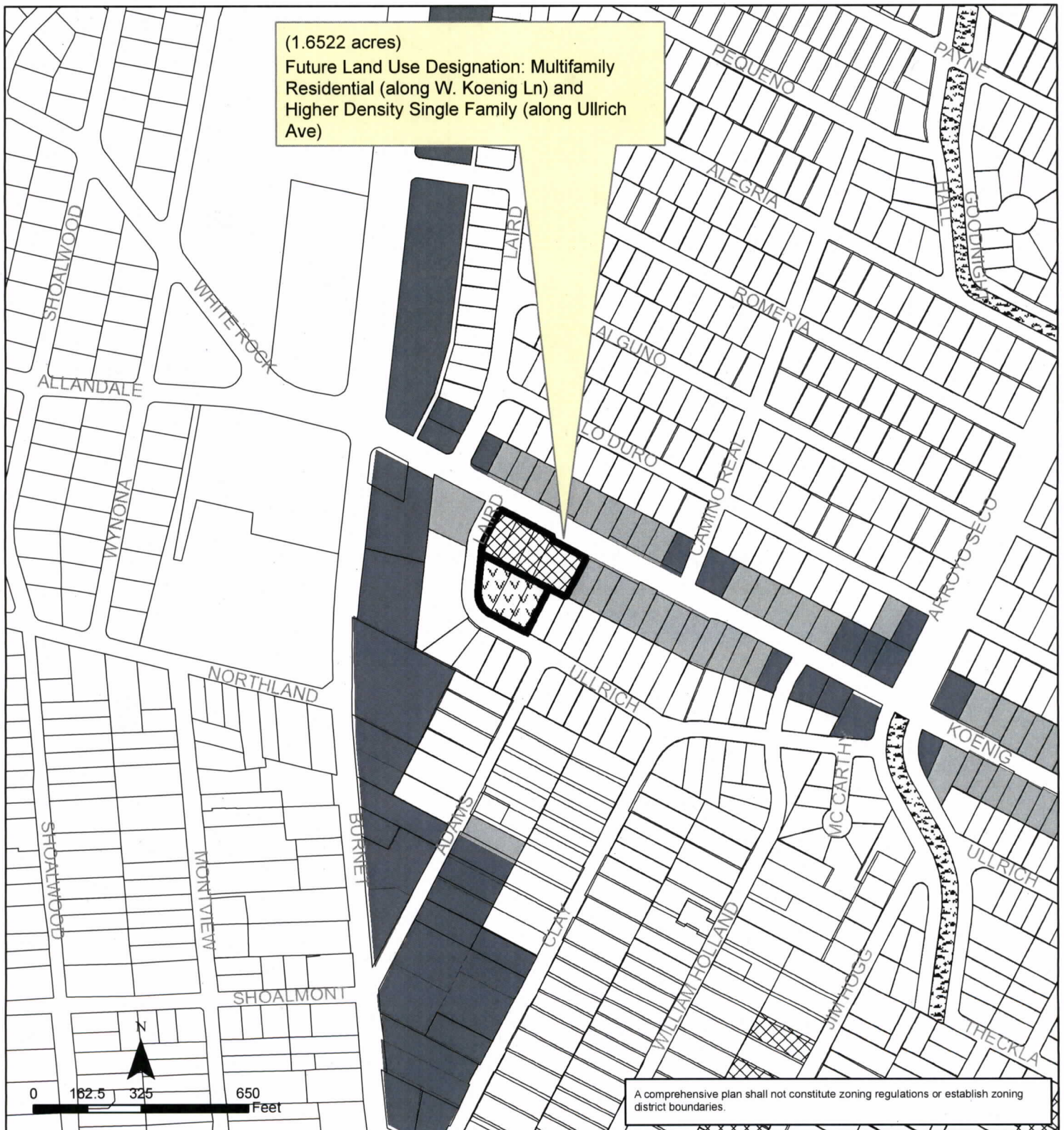
Exhibit A Brentwood/Highland Combined Neighborhood Planning Area NPA-2023-0018.02

This product is for informational purposes and may not have been prepared for or be suitable for legal, engineering, or surveying purposes. It does not represent an on-the-ground survey and represents only the approximate relative location of property boundaries.