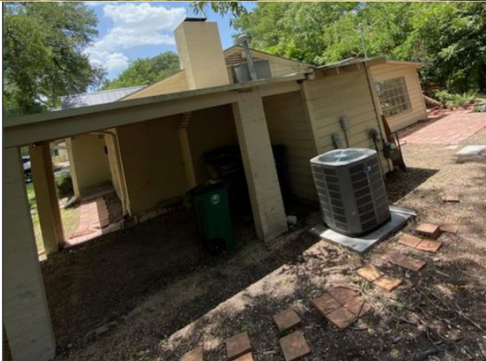
Demolition permit application, 2023