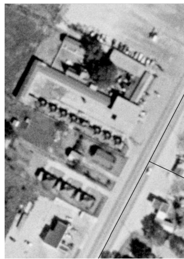
1940, 1958 aerial photos