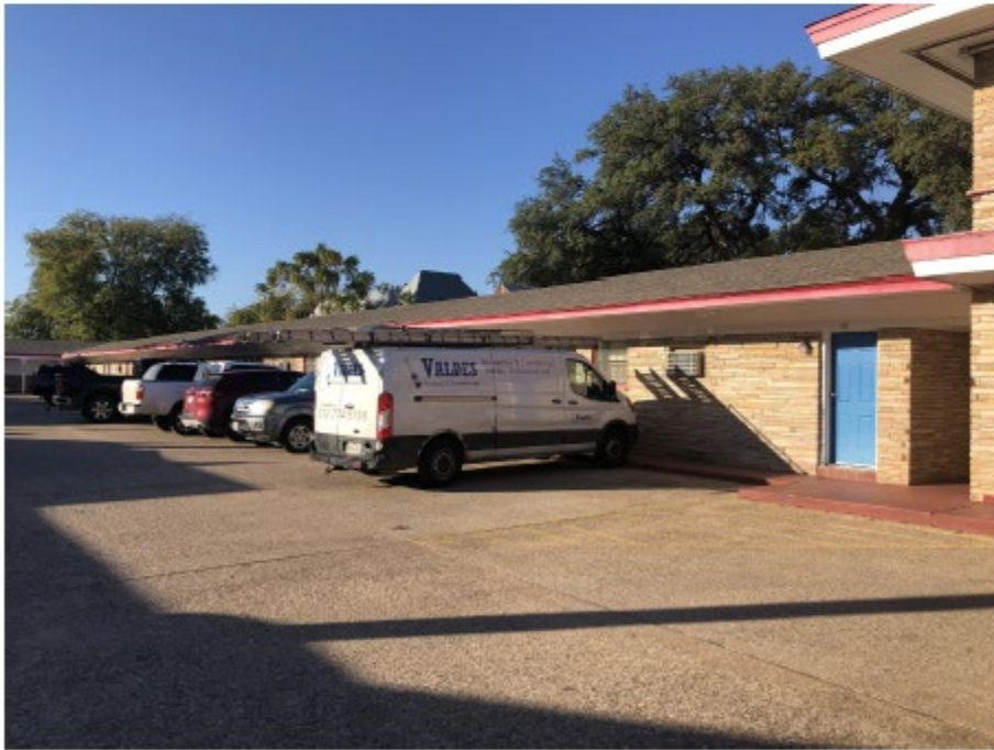
Demolition permit application, 2023