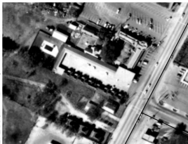
1965, 1977 aerial photos