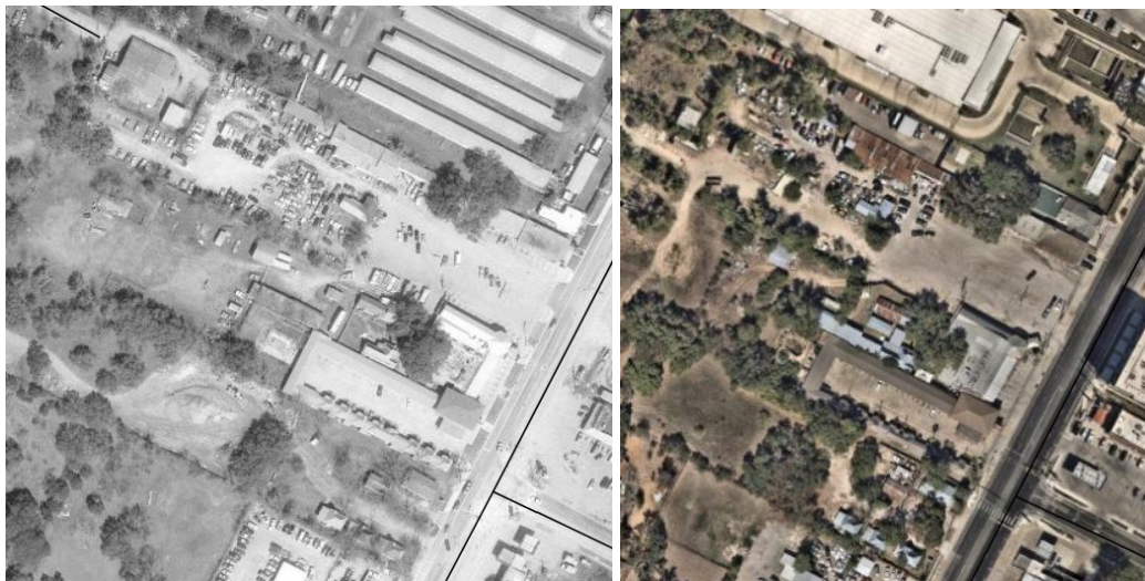
1997, 2022 aerial photos