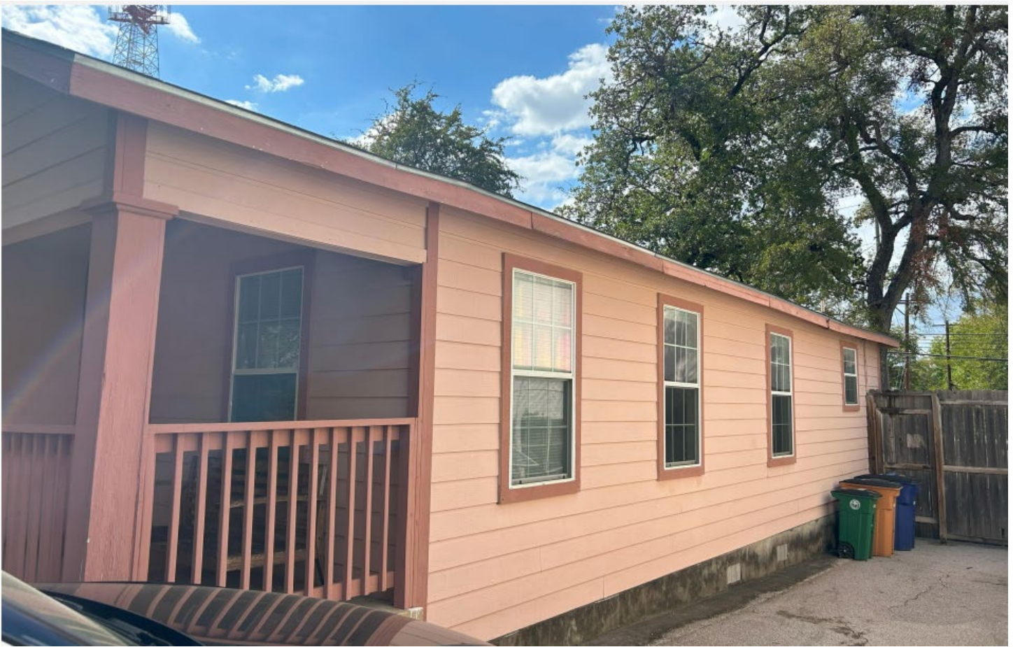
Demolition permit application, 2023