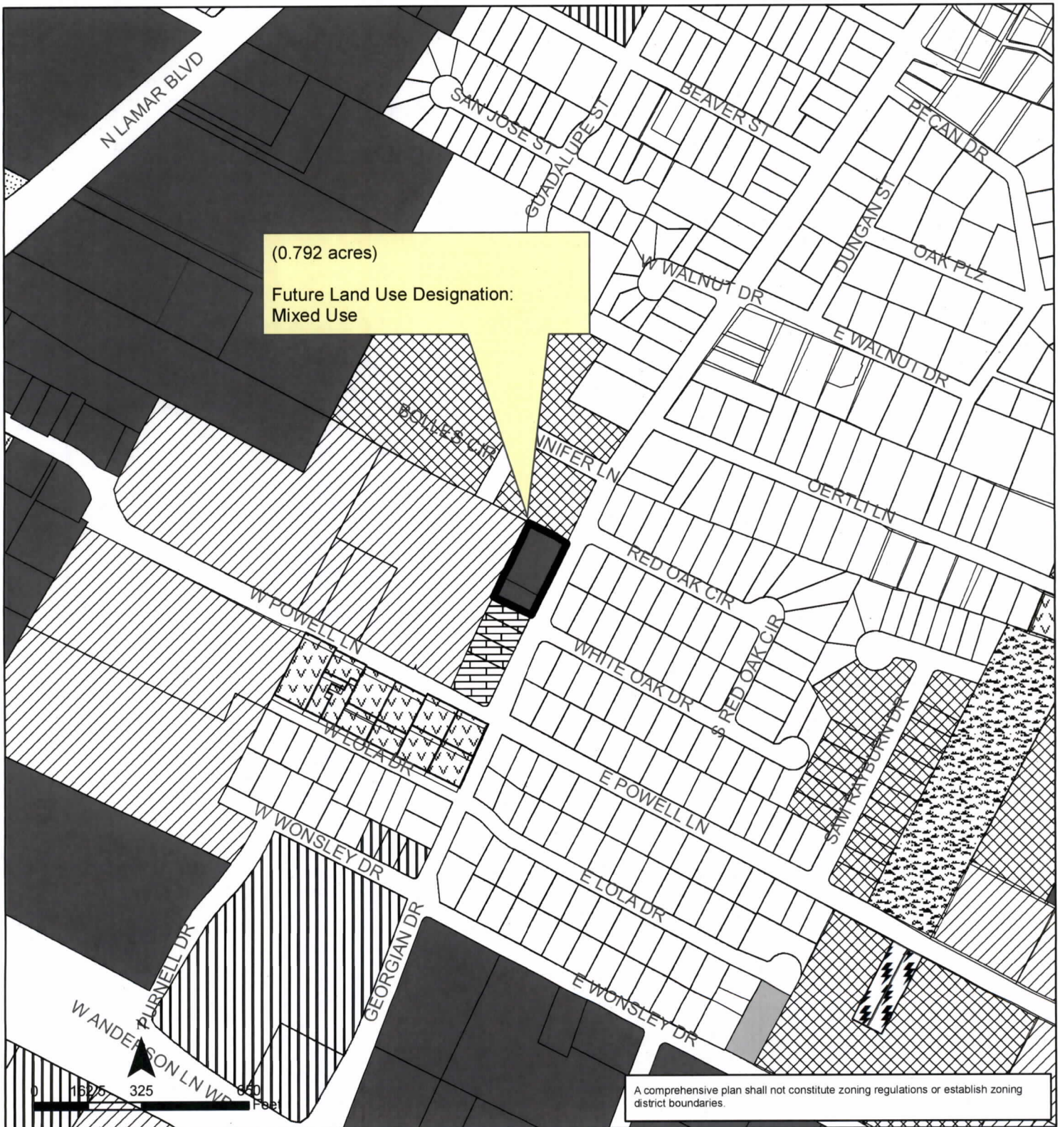
Exhibit A North Lamar Combined (Georgian Acres) Neighborhood Planning Area NPA-2022-0026.01

This product is for informational purposes and may not have been prepared for or be suitable for legal, engineering, or surveying purposes. It does not represent an on-the-ground survey and represents only the approximate relative location of property boundaries.