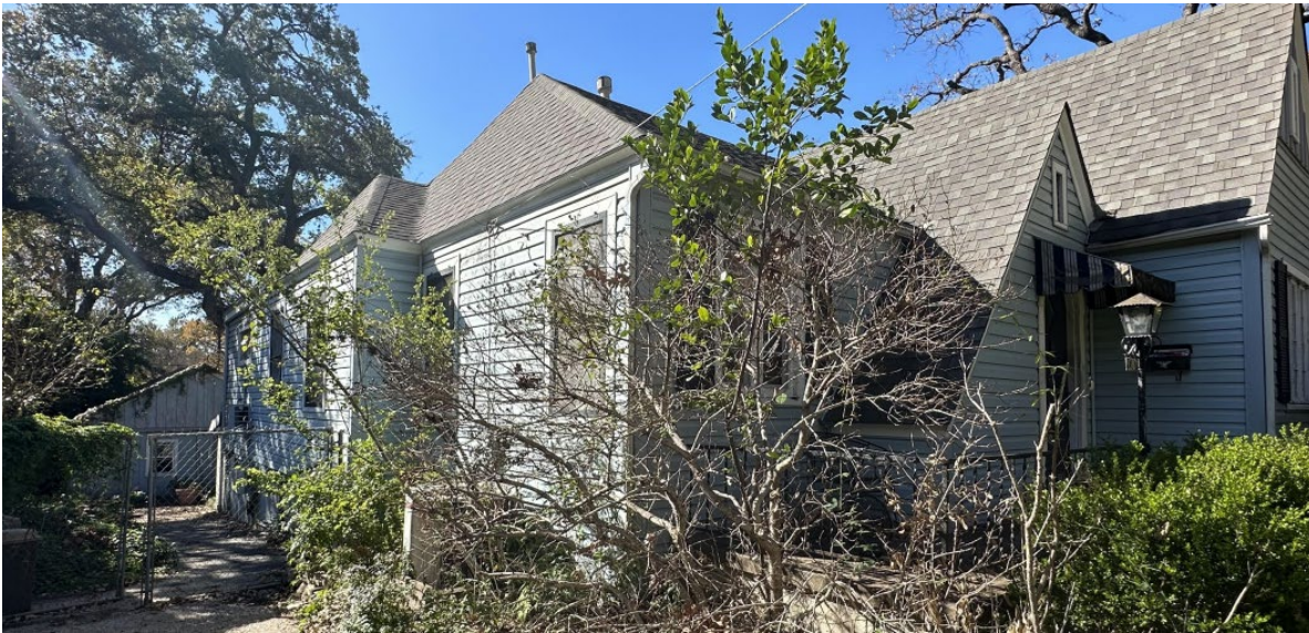
Demolition permit application, 2023