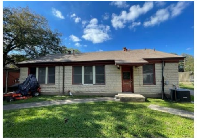
Demolition permit application, 2023