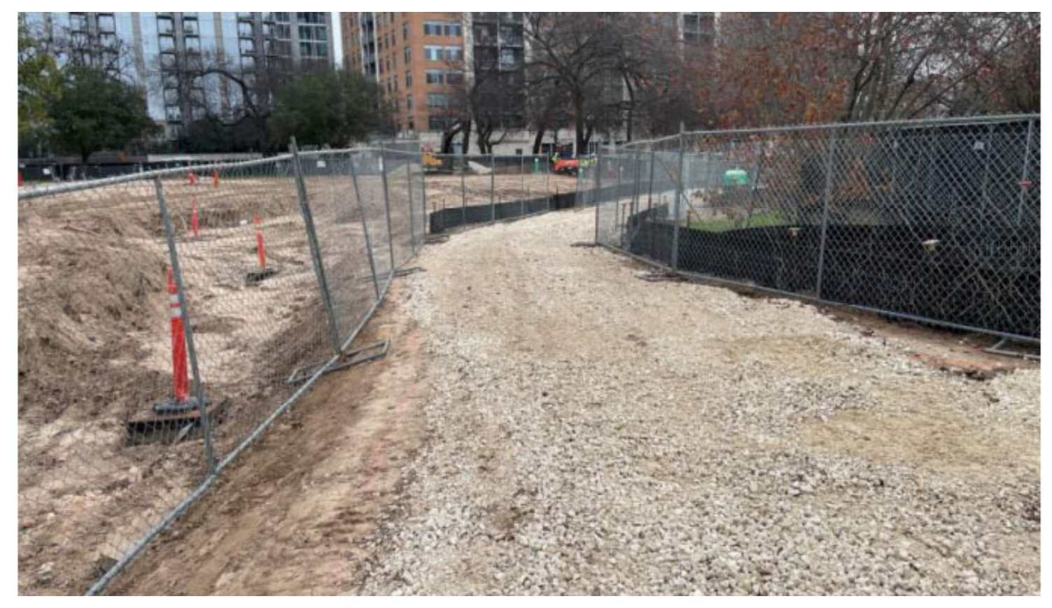
Zocalo: Temporary trail in progress (Southbound view)