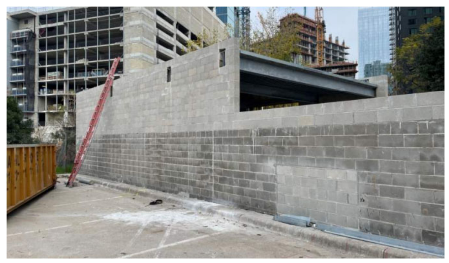
Central Utility Plant: Steel beams & decking installed.