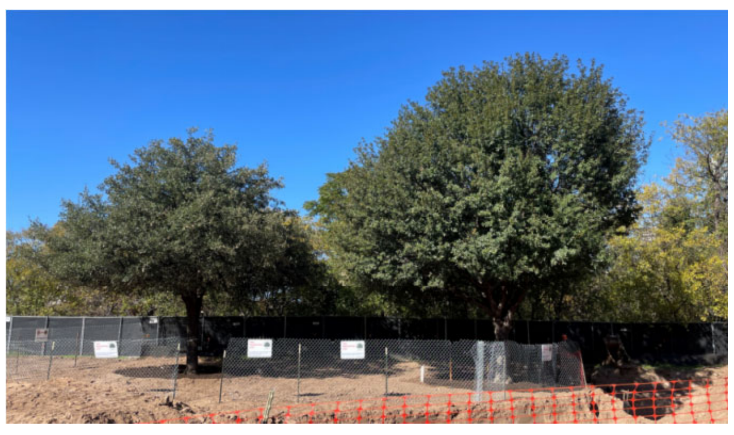
Site: View of relocated tree# 4679 (left) & #4689 (right)