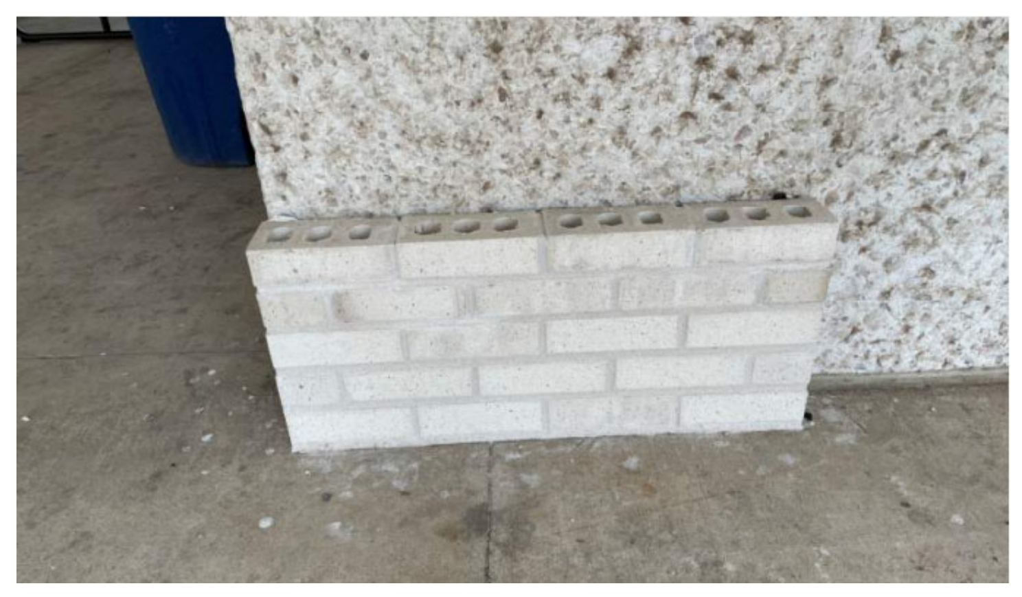
Central Utility Plant: Brick mortar mock-up