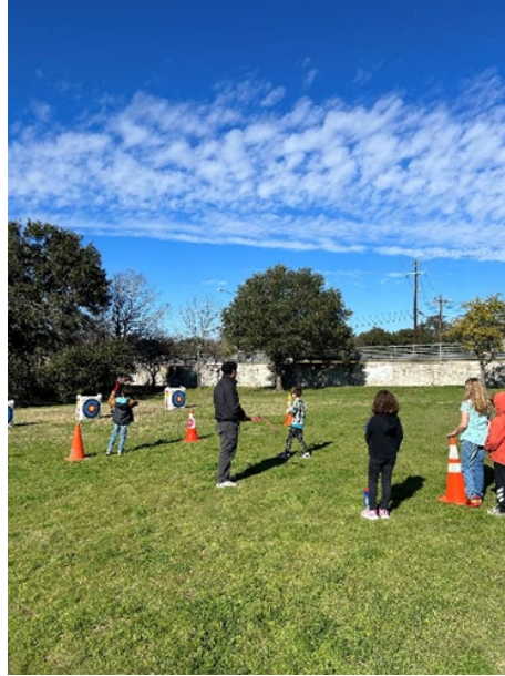
Dittmar Recreation Center Winter Break Camp 2024

George Morales Dove Springs Recreation Center: The George Morales Dove Springs Recreation Center hosted its annual Holiday event, “Santa’s Workshop”, on Saturday, December 16, 2023, from 10 a.m. – 12 p.m. This event featured family friendly holiday activities as well as breakfast for participants and free pictures with Santa. 375 visitors attended this event. District 2