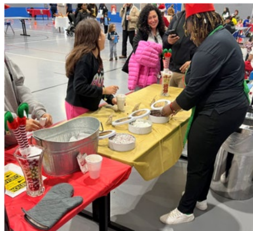
Participants engaging in creating custom gingerbread cookies and enjoying the hot coco station