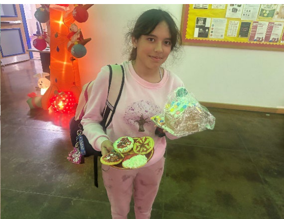
Parque Zaragoza's Cookies with Santa event

Rodolfo "Rudy" Mendez Recreation Center: Thursday, December 21, 2023, Mendez Recreation Center hosted their annual “Night Before Christmas Break”. Families enjoyed a fun and free night of games, were able to win prizes, had the option to enter a bike raffle, enjoyed hot chocolate and got a visit from Mr. & Mrs. Clause. Even the Grinch made an appearance. Every child received one gift and most of them went home with a new bike or scooter. Mendez Recreation Center would like to thank, Italex Builders, Inc., Austin Kickball Organization, Casa de Dios church, Fyrepic Photos, Travis County Precinct 4 and the many volunteers who made “Night Before Christmas Break” possible. District 3.