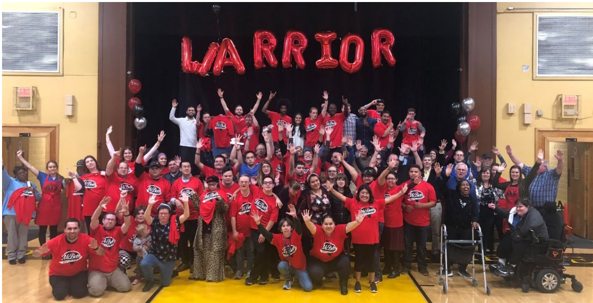
Adaptive Athletics at the 2023 Sports Awards Banquet

McBeth Recreation Center Sports Awards Banquet: McBeth Recreation Center's annual sports award banquet is Thursday, January 25 th , from 6:30 - 8:30 p.m., at Doris Miller Auditorium. It is expected to host 140 athletes, coaches, volunteers, and family members of the McBeth Adaptive Sports program. The evening is a celebration of the outstanding achievements and performances of those involved in McBeth Adaptive Sports. There were so many inspiring moments to pay tribute to in 2023, it promises to be a joyous occasion for all! District 5, 8