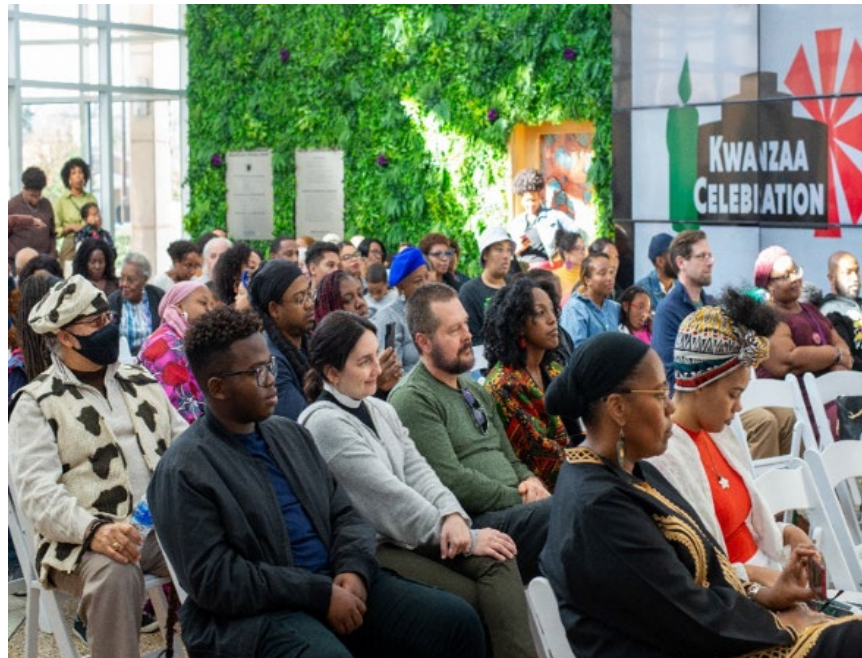
Community gathered at the 2024 Kwanzaa Nia Celebration at the Carver Museum and Cultural Center

George Washington Carver Museum and Cultural Center: On Saturday, December 30, 2023, from 1 – 3 p.m., the Carver community gathered in the lobby of the museum, also known as the Drum. A vast array of facilitators led the program with drumming, dancing, story time, and interactive learning. Nigerian food from Black-owned Lady T. Kitchen was served to close out the program. Immediately following, organizers opened the floor for community connecting and meaningful conversation, echoing the meaning of the fifth day of Kwanzaa, Nia , which encourages us to look within to not only set personal goals, but also to choose goals that benefit our community. This event was attended by 214 participants.