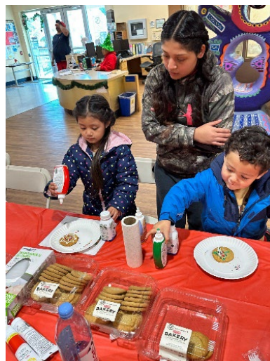
Community families make cookies and build Home Depot workshop kits at the Oswaldo A.B. Cantu/Pan American Recreation Center Community Holiday Celebration

Parque Zaragoza Recreation Center: Wednesday December 20, 2023, Parque Zaragoza Recreation Center hosted their annual “Cookies with Santa Event” from 5 – 7 p.m. The event included games, a gingerbread workshop, as well food and photos with Santa. The free event was attended by twenty-five community members. District 3