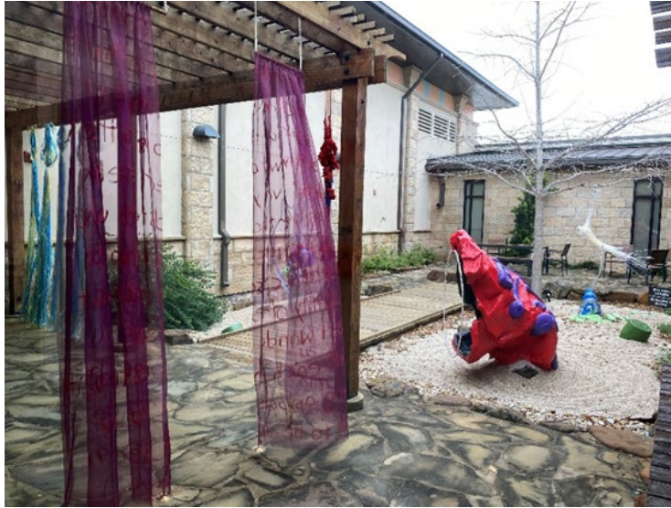
Tapestries and sculptural pieces from Spine Song in the AARC Zen Garden

Dottie Jordan Recreation Center Santa's Spectacular: Dottie Jordan Recreation Center held the first Santa Spectacular event on December 19, 2023, and with nearly 200 individuals in attendance. The event was centered around celebrating the winter holiday through delightful activities such as cookie and gingerbread decorating, coloring and creating sharable holiday crafts, as well as capturing a memorable family moment with Santa! District 1