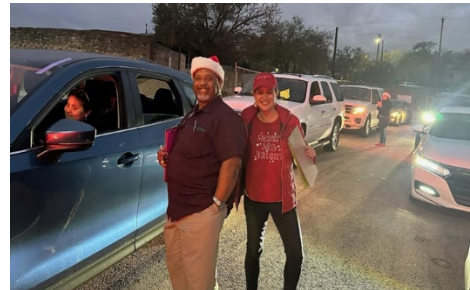
Staff members greeting community members in their cars

Turner-Roberts Recreation Center: Tuesday, December 19, 2023, Turner-Roberts hosted their Youth Holiday Showcase. The event was held on site in the multiple purpose gym. The showcase featured community youth caroling and performing dance routines. Attendees were provided refreshments while they enjoyed the showcase. The event was attended by an estimated 80 people and was free to the public. District 1