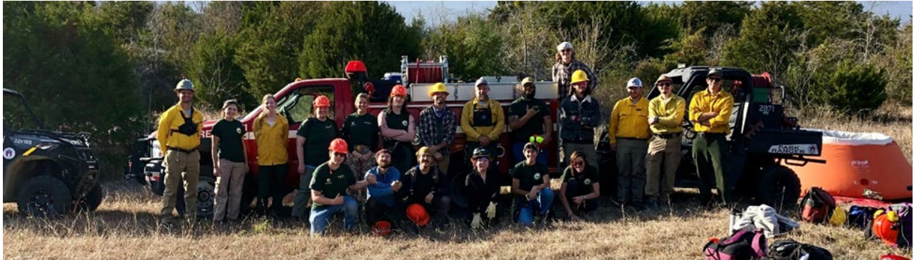
Students and instructors of the S-130 Introductory Wildland Firefighter course at the Louis René Barerra Indiangrass Wildlife Sanctuary

Austin Civilian Conservation Corps: The Austin Civilian Conservation Corps was able to successfully send 16 participants and staff throughout our collaborative to attend the Texas Children in Nature Network (TCINN) Summit on December 6-8, 2023. This summit allowed for members to engage with other municipalities to share ideas on how to effectively plan their nature programs. Check out this video that was put together by the Digital Media from Austin Civilian Conservation Corps that highlights some of the events that took place. Districts: 1,2,3,4,7,9