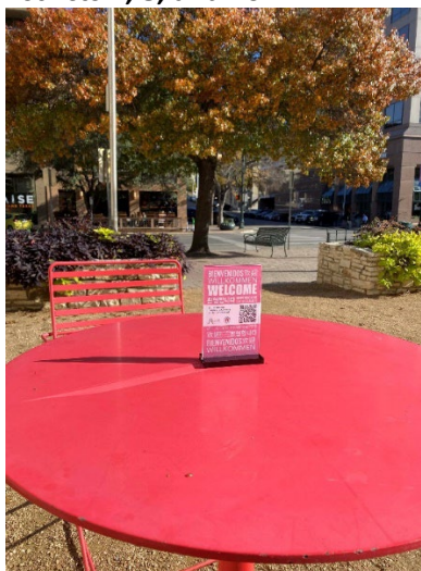
QR Code set up at Old Bakery and Emporium

Visitor Sign-In Pilot Program Launched: The Historic Preservation and Tourism Program has launched a pilot program at three Department sites to capture visitor information as part of the Department's tourism enhancement efforts. The pilot project at Mayfield Park, Old Bakery and Emporium, and Austin Nature and Science Center will explore a unified approach to visitor tracking. Each of these sites has multi-language signage with QR codes. Questions focus on gathering information about visitor origin, how visitors learn about Department sites, and lodging selections by out-of-town visitors. The data received will enable the Department to learn more about tourists who visit historic sites and identify peak visitor months, market trade areas, attendance trends, percentage of visitors from outside of Austin, effectiveness of current promotional efforts and how many of those tourists are contributing to Hotel Occupancy Tax (HOT) revenue, which funds operations and improvement at many Department historic sites. Following 12 months of testing, survey data will be reviewed to determine the effectiveness of the pilot program. Districts 1, 8, and 10