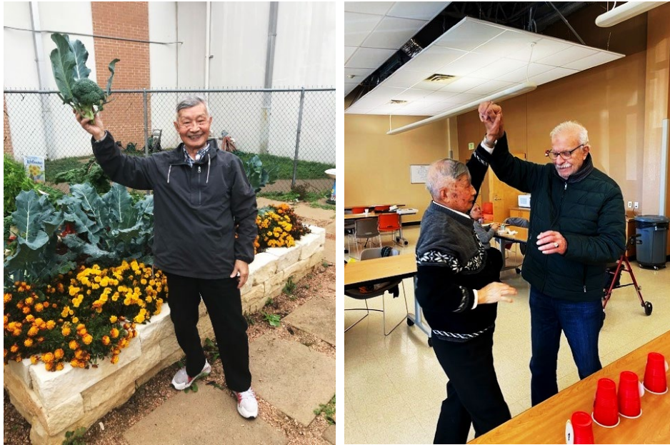
Varsity Generation participants enjoying the New Years Day activity and Senior Garden

Virginia L. Brown Recreation Center: On December 12, 2023, the Varsity Generation group at Virginia L. Brown Recreation Center increased their speed, social, communication, and cognitive skills with “Minute to Win It” games during the Center’s New Year’s Activity Day. During a timed game, one of our pairs completed a task in 40 seconds. Participants also enjoyed the fall harvest in the Senior Garden before the holiday break. District 4.