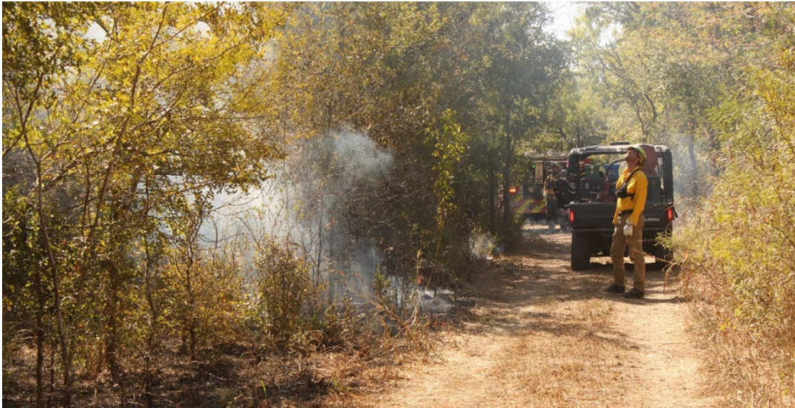
Parks and Recreation Department staff monitor fire behavior and smoke during a prescribed burn at the Onion Creek Wildlife Sanctuary

Land Management Wildfire Risk Mitigation Projects: The Parks and Recreation Department Land Management Program leads the implementation and maintenance of wildland fuel reduction projects on parkland to reduce wildfire risk to natural resources, park assets, and neighboring structures. Emma Long Metropolitan Park, Circle C Metropolitan Park, the Southern Walnut Creek Greenbelt, and the Barton Creek Greenbelt and wilderness park system are some areas of parkland that have been identified as priority for fuel reduction projects in the next two fiscal years. Districts 1, 3, 5, 8, 10