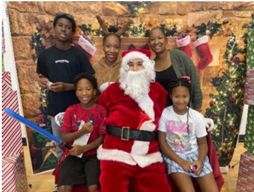
Family photo with Santa Clause at Gus Garcia

Gustavo “Gus” Garcia Recreation Center: On Saturday, December 9, 2023, Gus Garcia Recreation Center hosted its annual holiday event “Breakfast with Santa”. The 581 Attendees were able to take photos with Santa Clause and enjoy a hot breakfast consisting of waffles, bacon, sausage, and assorted juices from 10 a.m. – 12 p.m. In addition to the festivities, 65 prizes were raffled off to lucky recipients. District 4