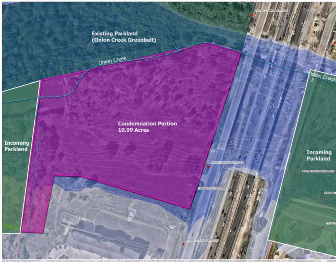
Map of planned acquisitions along the Onion Creek Greenbelt

Parkland Acquisition: On January 18 th , Council approved the filing of eminent domain proceedings to acquire approximately 11 acres for public parkland at 12000 S. IH 35, Austin, TX. The acquisition is along the east side of Onion Creek and will support connection of the greenbelt and provide connectivity to existing and future parkland. District 5