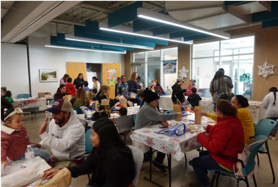
Community members making crafts

Montopolis Recreation and Community Center: Montopolis Recreation and Community Center hosted its first ever “Crafting and Cookies” event. Community members were given the material to make holiday crafts and cookies. “Craft and Cookies” took place on Saturday, December 16, 2023, from 11 a.m. – 1 p.m. An estimated 40 community members participated. District 3