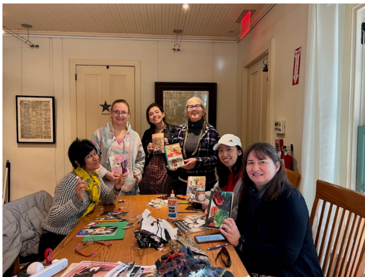
Final Fridays workshop participants pose with their finished journals

Emma S. Barrientos Mexican American Cultural Center: On Saturday, January 13 th , from 10 a.m. – 12 p.m., families participated in the Sabados en Familia bilingual story time event. This free event was at the Central Library. Participants read Bright Star (or Lucero in Spanish) by Yuyi Morales, which explores the plants, animals, and people that live in the deserts of the borderlands. Participants made a clay cactus plant and decorated a paper cup to plant it in. This event was participated by 150 participants. District 9