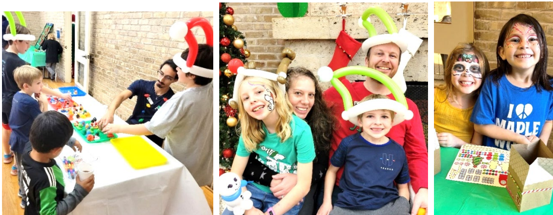
Holly Jolly participants playing games, posing for photos, and creating crafts during the event

Hancock Recreation Center: Hancock hosted its annual "Holly Jolly Jamboree and Toy Drive" on December 8, 2023. Families visited the center for holiday crafts, games, and snacks while donating toys to the neighborhood Helping Hand Home. A total of 220 people visited the center for the event. District 9