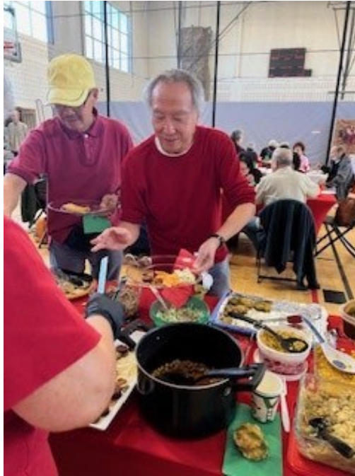
A Varsity Generation Participant Making a Plate at Gus Garcia

Virginia L. Brown Recreation Center: Virginia L. Brown Recreation Center hosted their annual “Winter Workshop” on Wednesday, December 20, 2023. The event took place in the gymnasium where over 300 community visitors enjoyed a variety of fall themed games and activities including a food distribution for community members in the arts and crafts room that was sponsored by the Central Austin Texas Food Bank. Virginia L. Brown staff raffled off over 100 stuffed animals for youth participants and 15 cakes to families that were sponsored by Brown Santa and the Austin Central Texas Food Bank. District 4.