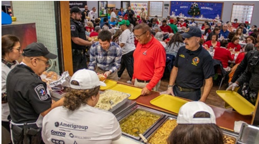
Austin Fire Staff serving lunch to program participants

Conley-Guerrero Senior Activity Center: On Wednesday, December 13, 2023, Conley- Guerrero hosted the 19 th Annual Fireman’s Luncheon. Over 350 participants were able to enjoy a great meal and partake in the gift giveaway held by the Austin Fire Department. Varsity generation community members and families were able to enjoy each other’s company and build new relationships. District 1