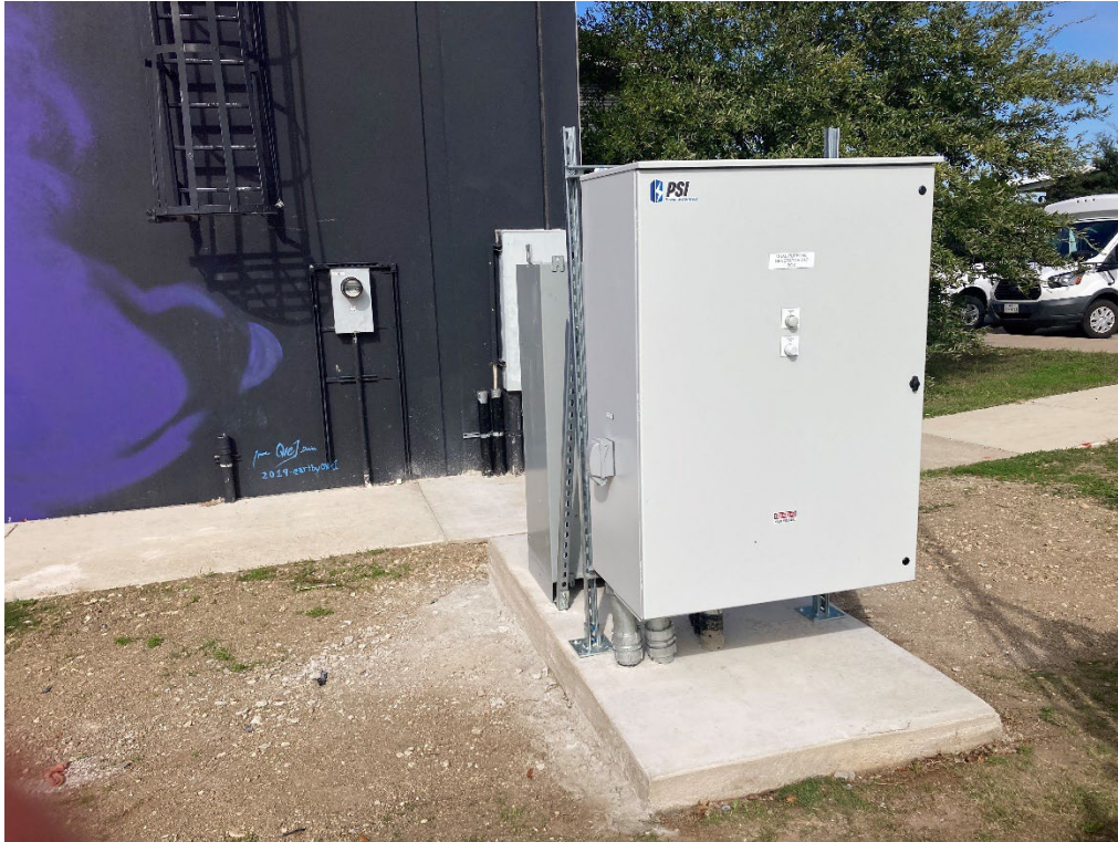
New docking station for redundant power at Turner Roberts Multipurpose Gymnasium.

FY24 Historic Preservation Fund: On January 18 th , Council approved a request that will allow $1.8M to be transferred from the Fiscal Year 2023-2024 Economic Development (EDD) Operating Budget Special Revenue Historic Preservation Fund ( Ordinance No. 20230816-008 ) to the Parks and Recreation Department CIP. In essence, this memorializes the dedication of the Parks and Recreation Department's FY2024 Historic Preservation Fund CIP allocation (including a budget amendment for an additional allocation) to the Barton Springs Bathhouse rehabilitation project as well as several small projects. EDD will also provide recommendations for Heritage Grant recipients, which are anticipated to include several Department partner groups. Multiple Districts