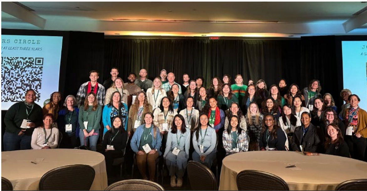
Austin Civilian Conservation Corps Attendees at the Texas Children in Nature Summit

Austin Civilian Conservation Corps: The Austin Civilian Conservation Corps was able to successfully send 16 participants and staff throughout our collaborative to attend the Texas Children in Nature Network (TCINN) Summit on December 6-8, 2023. This summit allowed for members to engage with other municipalities to share ideas on how to effectively plan their nature programs. Check out this video that was put together by the Digital Media from Austin Civilian Conservation Corps that highlights some of the events that took place. Districts: 1,2,3,4,7,9