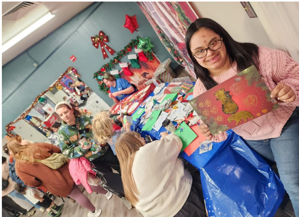
Santa's Spectacular Art Station

Dottie Jordan Recreation Center Santa's Spectacular: Dottie Jordan Recreation Center held the first Santa Spectacular event on December 19, 2023, and with nearly 200 individuals in attendance. The event was centered around celebrating the winter holiday through delightful activities such as cookie and gingerbread decorating, coloring and creating sharable holiday crafts, as well as capturing a memorable family moment with Santa! District 1