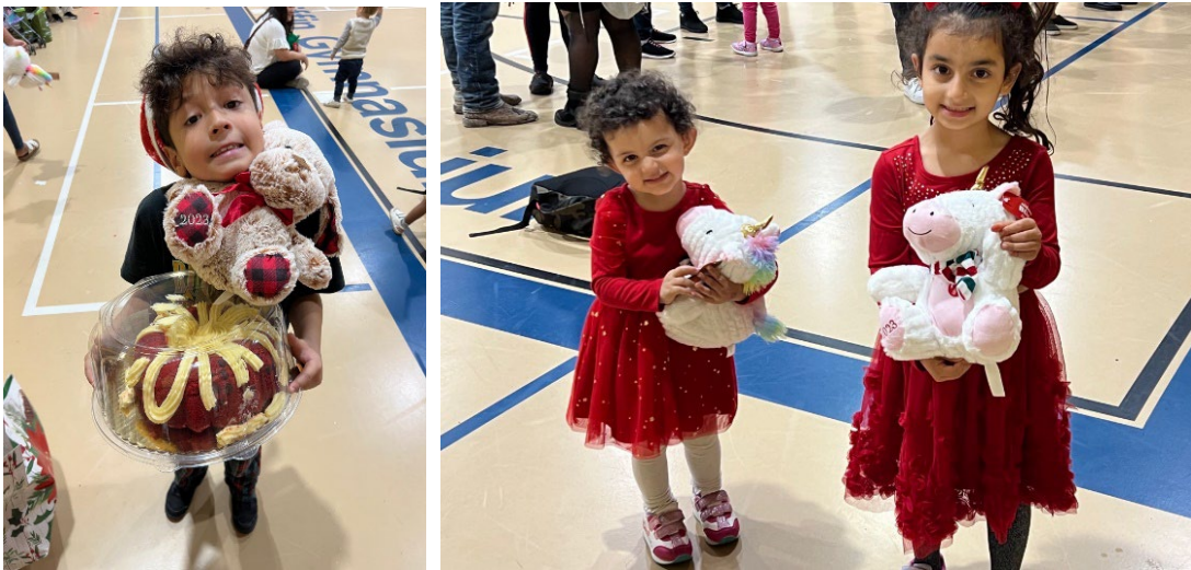
Youth Community Members with their winning raffle prizes during the event

Virginia L. Brown Recreation Center: Virginia L. Brown Recreation Center hosted their annual “Winter Workshop” on Wednesday, December 20, 2023. The event took place in the gymnasium where over 300 community visitors enjoyed a variety of fall themed games and activities including a food distribution for community members in the arts and crafts room that was sponsored by the Central Austin Texas Food Bank. Virginia L. Brown staff raffled off over 100 stuffed animals for youth participants and 15 cakes to families that were sponsored by Brown Santa and the Austin Central Texas Food Bank. District 4.