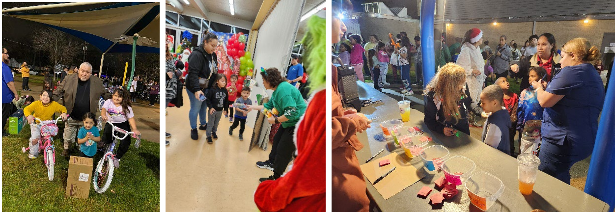
Families within the community join the staff at Mendez Recreation Night Before Christmas Break event

Gustavo “Gus” Garcia Recreation Center: On Saturday, December 9, 2023, Gus Garcia Recreation Center hosted its annual holiday event “Breakfast with Santa”. The 581 Attendees were able to take photos with Santa Clause and enjoy a hot breakfast consisting of waffles, bacon, sausage, and assorted juices from 10 a.m. – 12 p.m. In addition to the festivities, 65 prizes were raffled off to lucky recipients. District 4