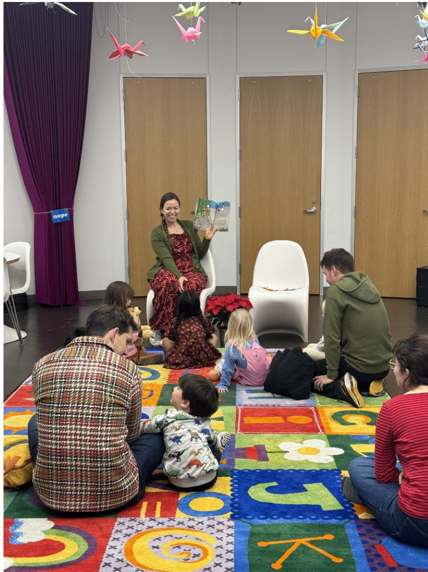
Sabados en Familia in December at Austin Central Library

Lifeguard Recruitment, Hiring & Training: As of January 4 th the Aquatics Division has successfully recertified 198 full-time (winter and returning) guards and staff for FY24. At this time last year, there were only 141. Additionally, the Aquatics Division is conducting some small (4-6) person renewal classes for individuals who could not attend training in November and December. Multiple Districts