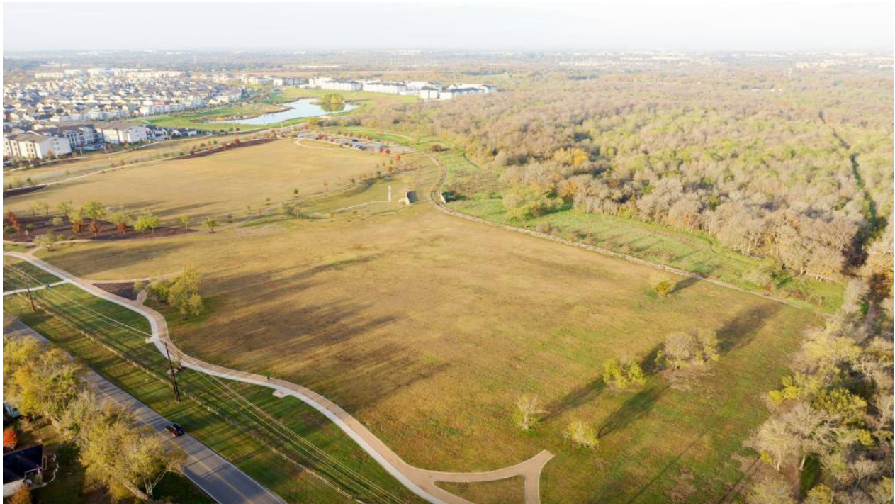
Current conditions at Onion Creek Metro Park

https://www.austintexas.gov/Onion-Creek-All-Abilities