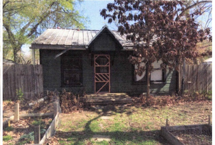
Demolition permit application, 2023