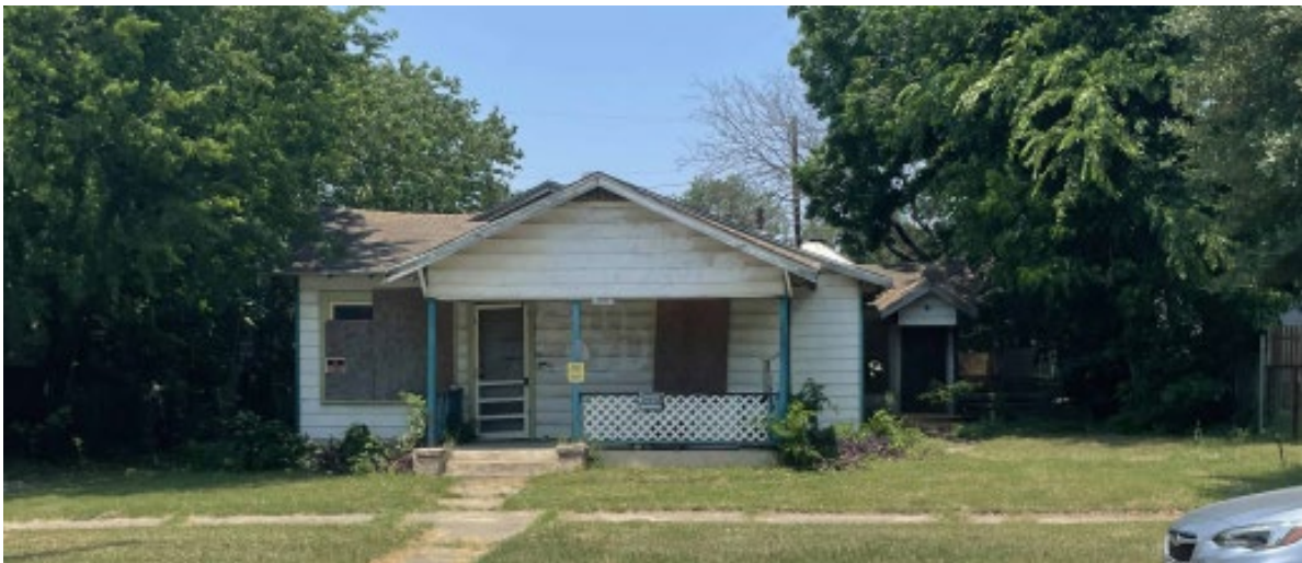
Partial demolition and remodel application, 2023