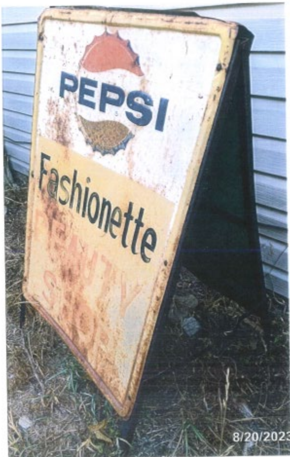
Original Fashionette Beauty Shop Sign