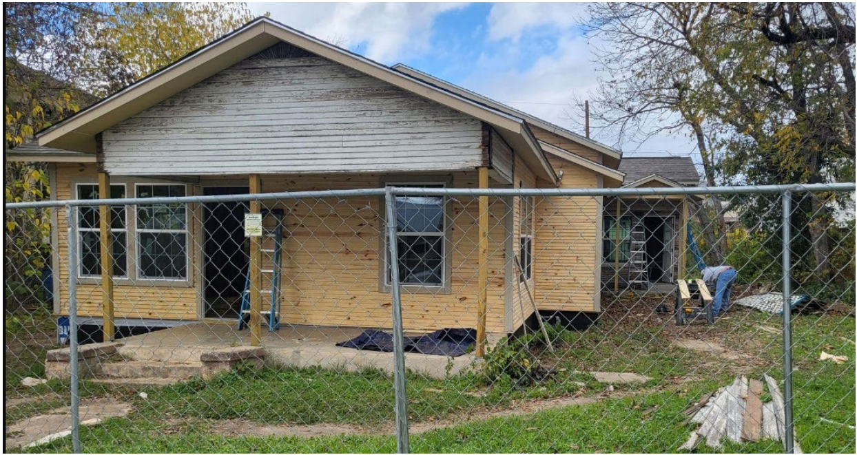
Pending historic zoning application, 2023