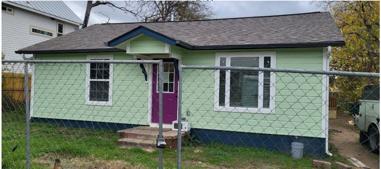
Pending historic zoning application, 2023 – back house