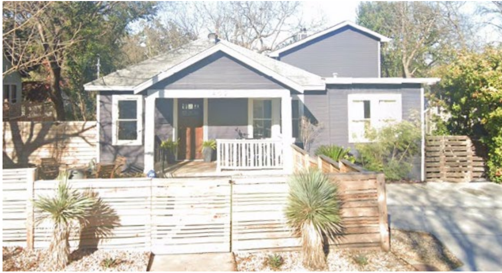
Google Street View, 2022