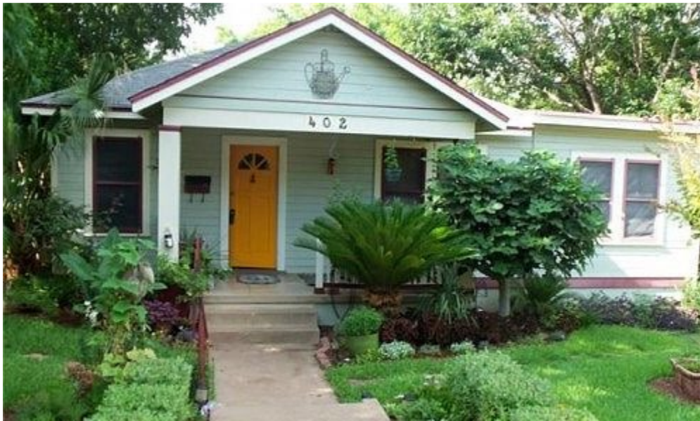
Zillow.com, ca. 2016