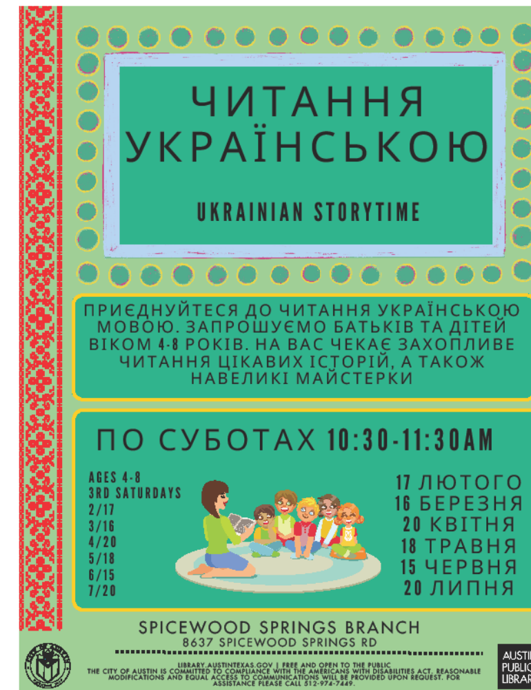
Ukrainian Language story time

* We currently have story times in Spanish, Japanese, French, German, Ukrainian and Arabic.