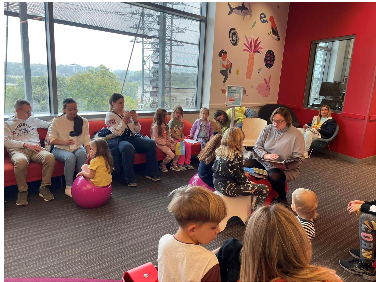
Tour of the Ukrainian community in Austin