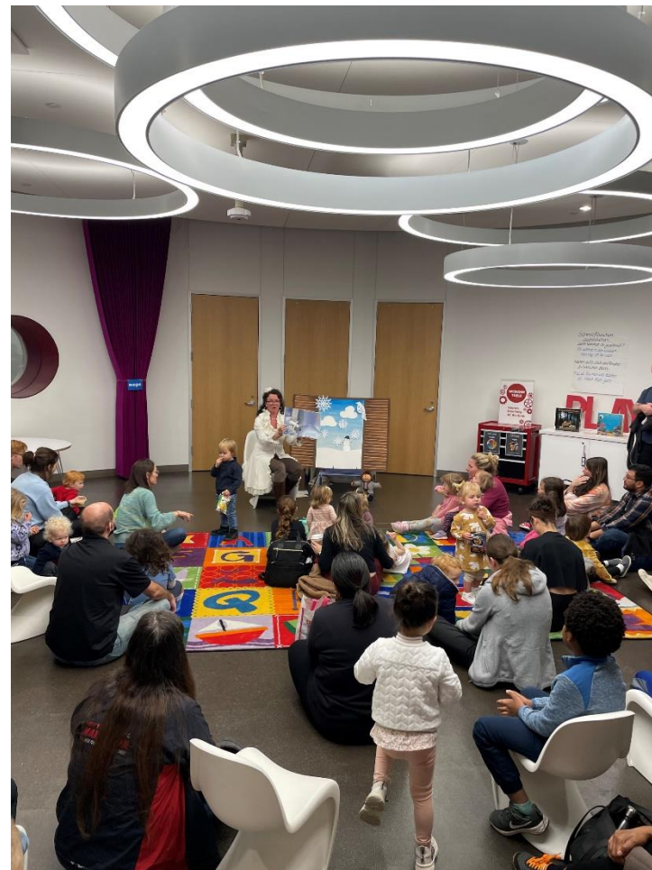
German Language story time