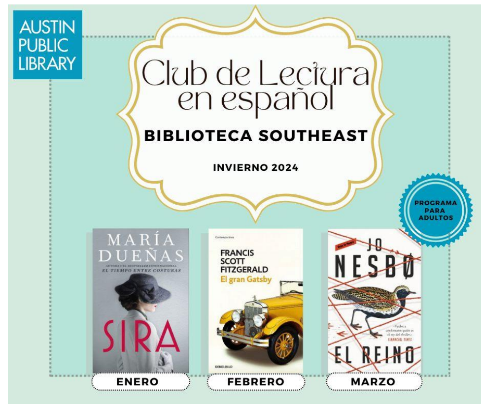
Spanish Language book clubs