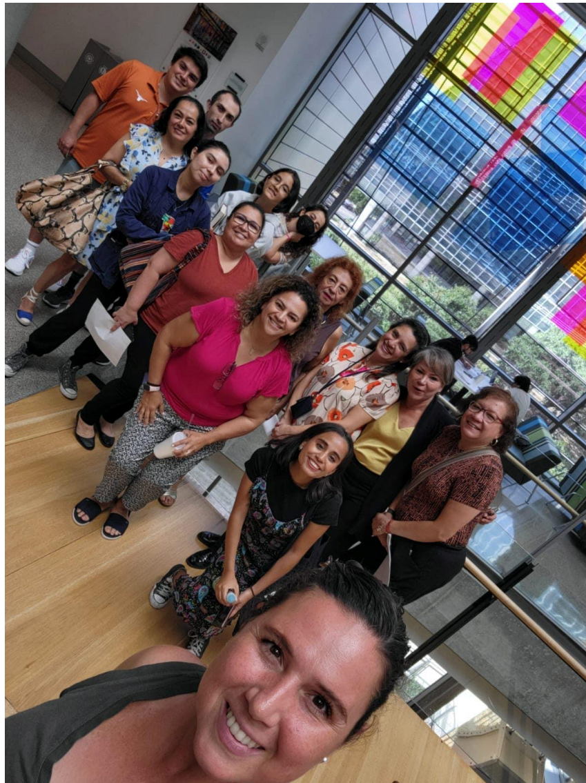
Tour of Mexican women in Austin