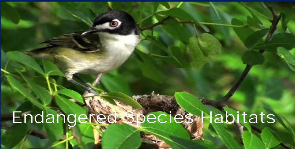
Endangered Species Habitats

Rapid development threatens ecologically and culturally rich land