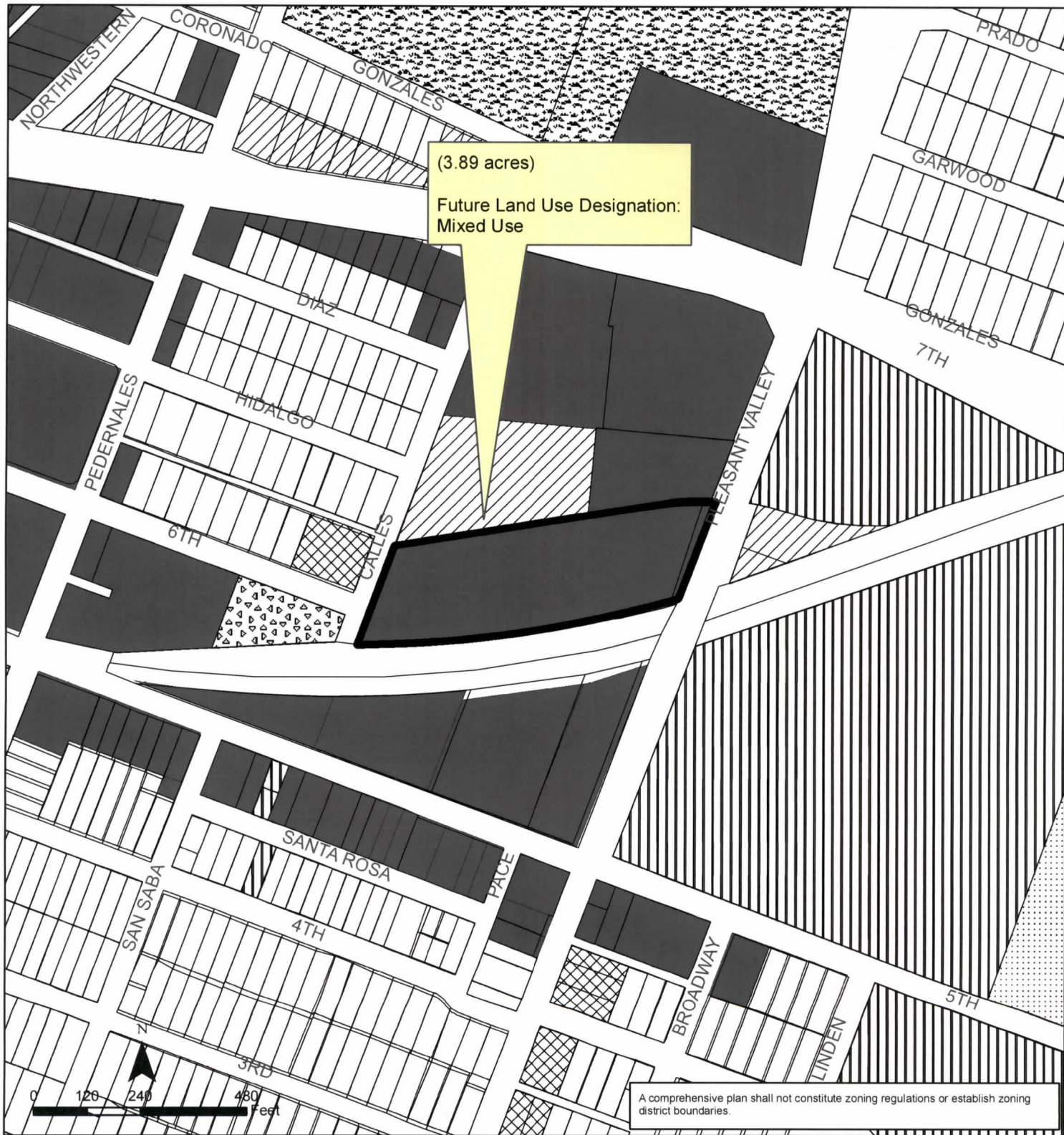
Exhibit A Holly Neighborhood Planning Area NPA-2023-0010.01

This product is for informational purposes and may not have been prepared for or be suitable for legal, engineering, or surveying purposes. It does not represent an on-the-ground survey and represents only the approximate relative location of property boundaries.