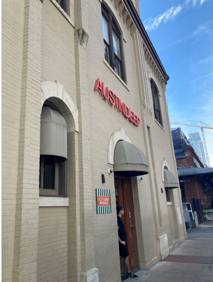
Historic landmark inspection photos, 2024