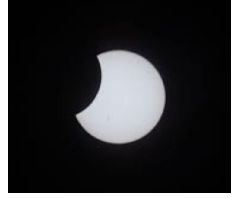
Use Solar Glasses!!!