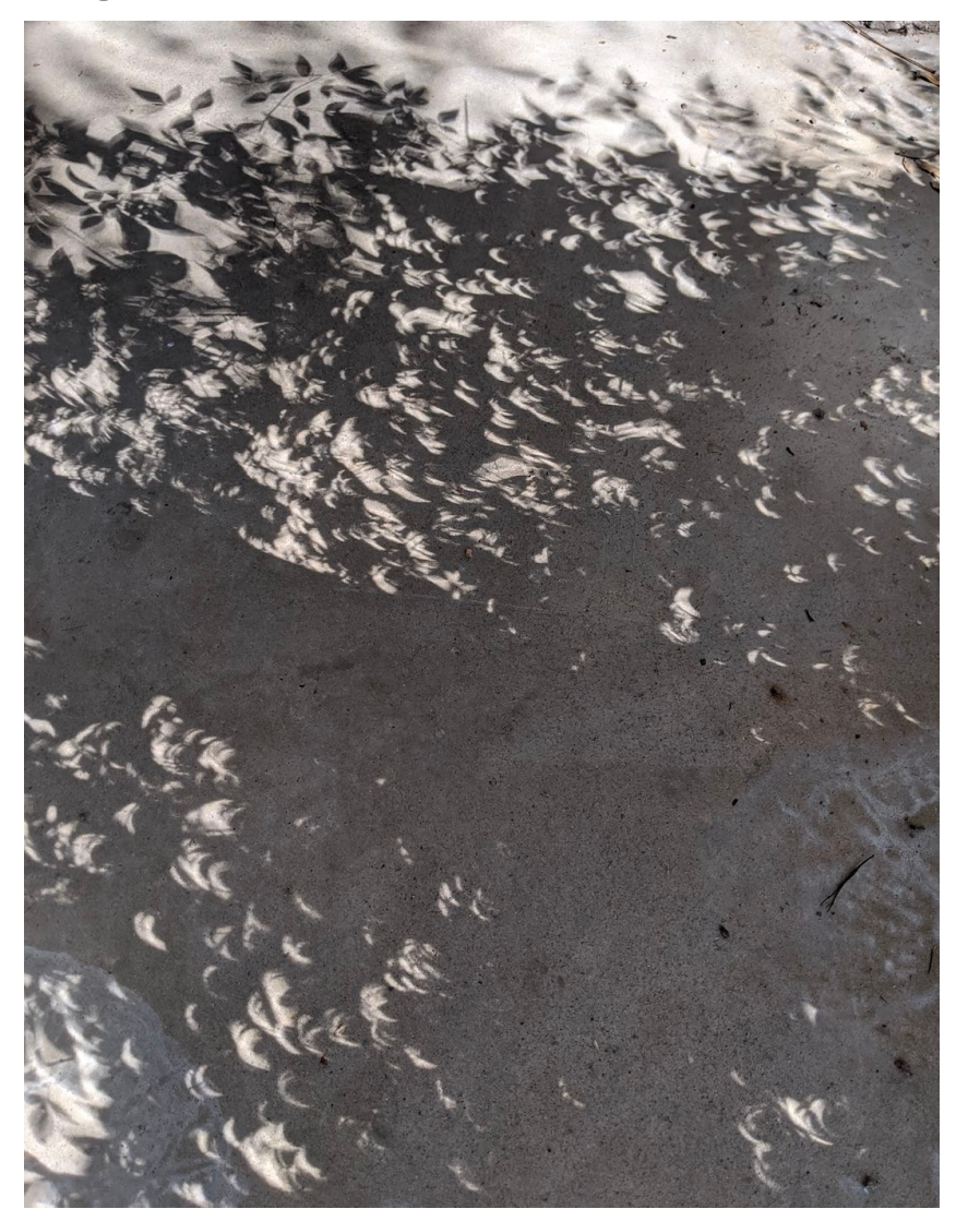
My porch from the Oct 14, 2023, annular eclipse

➤ If you don't have solar viewing glasses, use a tree and look at the ground!