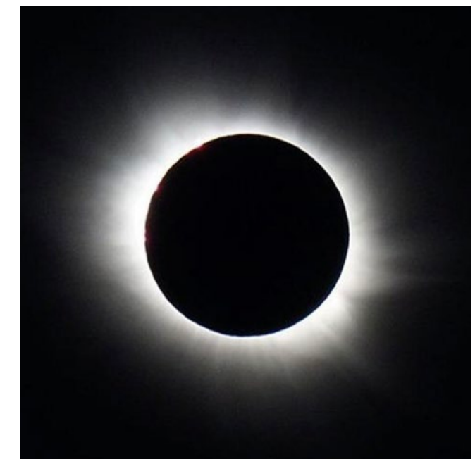
Use Naked Eye during Totality