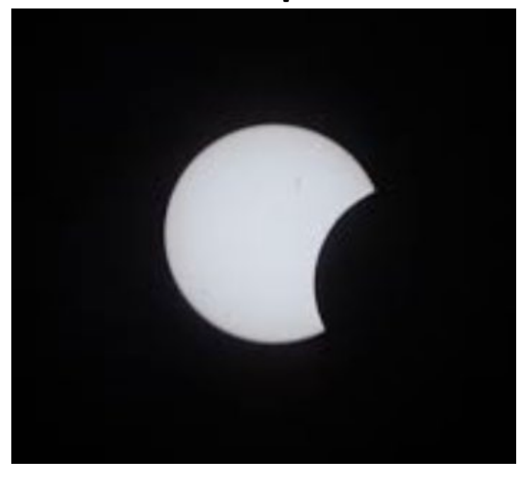
Use Solar Glasses!!!