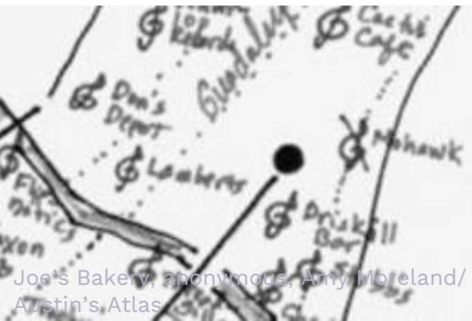
Joe's Bakery, anonymous, Amy Moreland/ Austin's Atlas

Historic preservation in Austin actively engages communities in protecting and sharing important places and stories. Preservation uses the past to create a shared sense of belonging and to shape an equitable, inclusive, sustainable, and economically vital future for all.