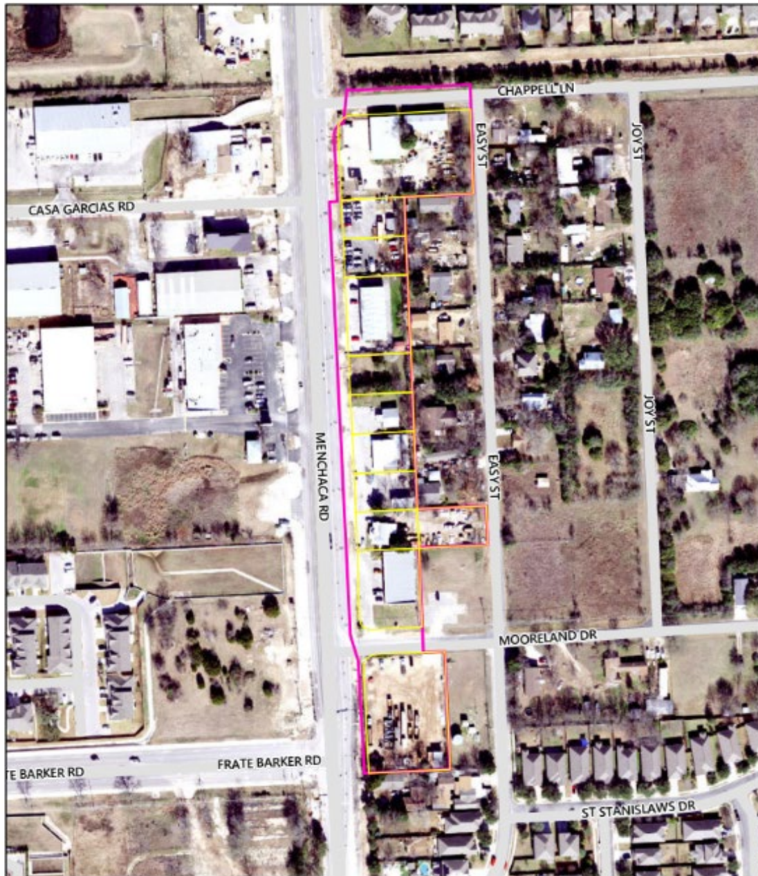
C7a-2017-0003: Mooreland Addition