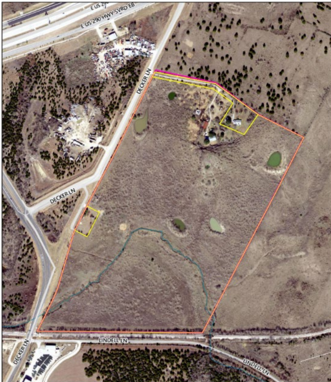
C7a-2016-0009: Wildhorse/Webb Tract