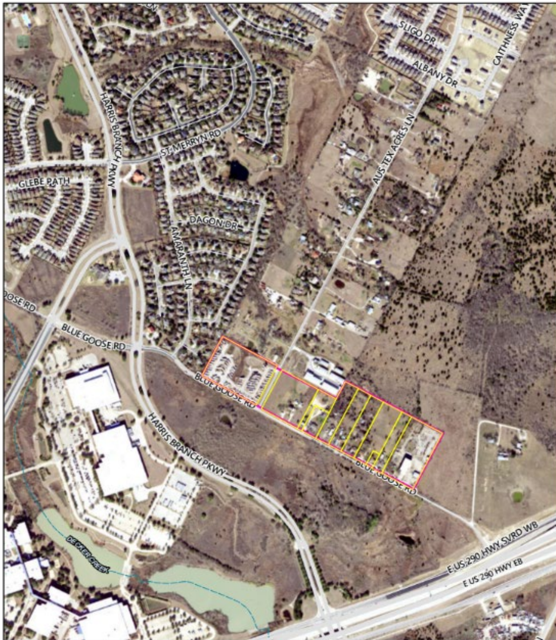
C7a-2015-0007: Blue Goose Road