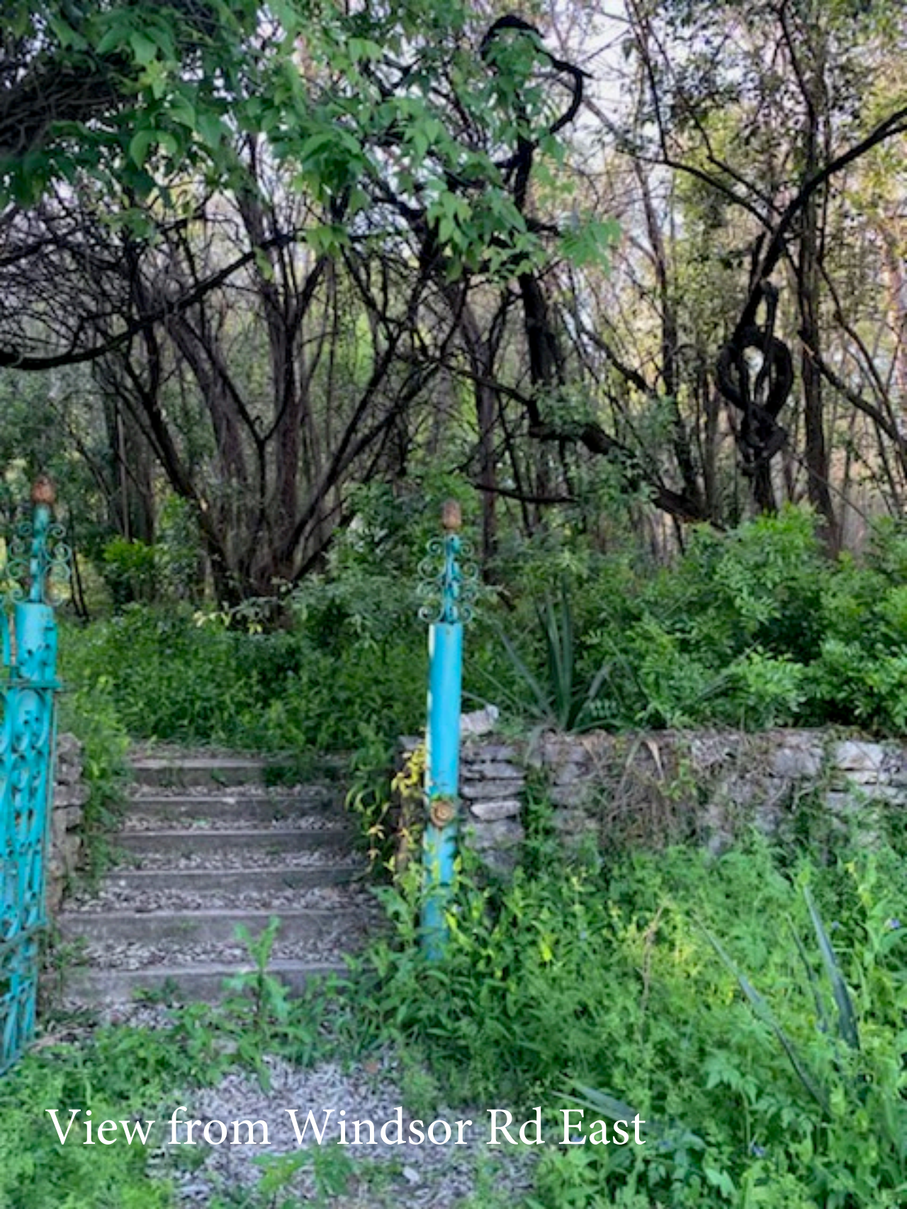
View from Windsor Rd East