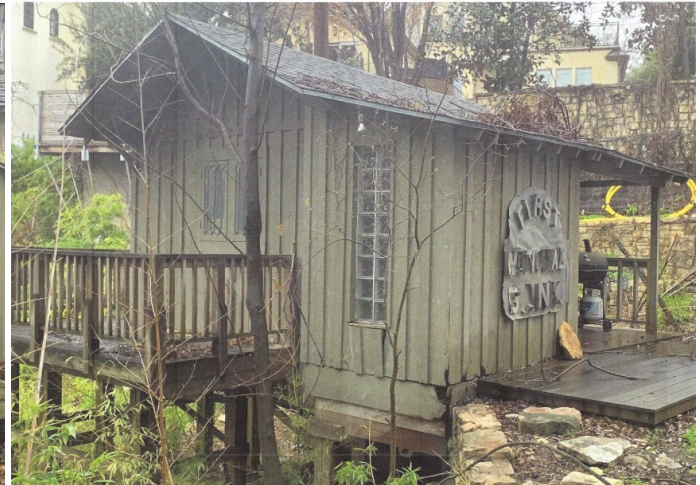
Demolition permit application, 2024