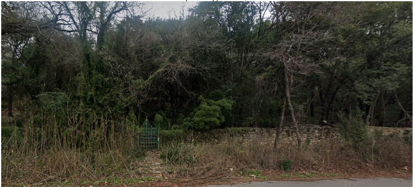
Original entrance from 2300 E. Windsor Road. Google Street View, 2023.