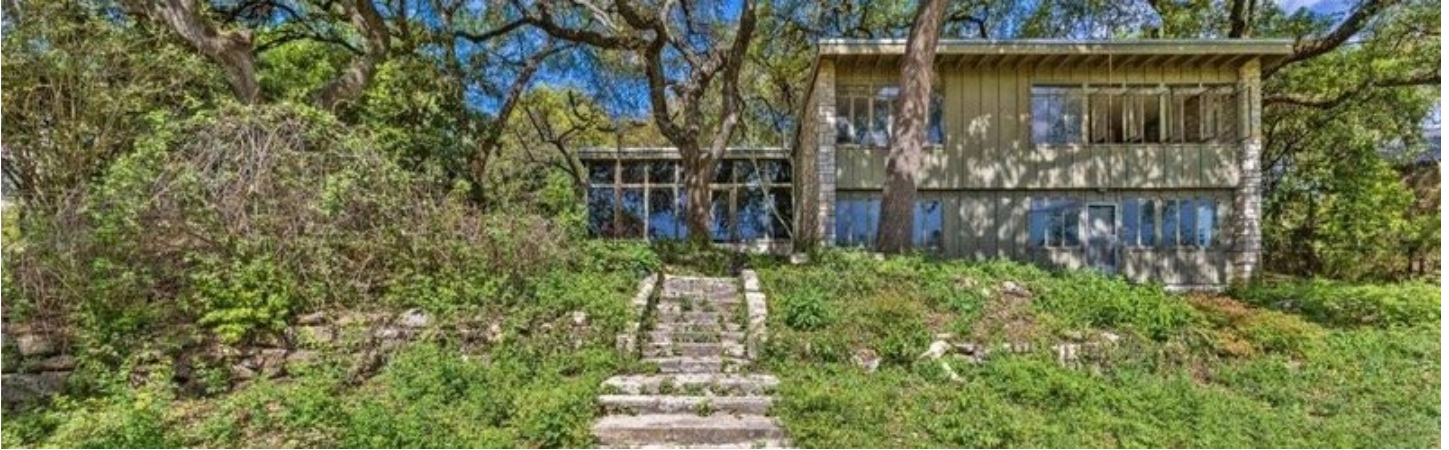
Creede Fitch via Jimmy Gilmore & Co., 2023. https://creedefitch.com/austin-modern-homes/2307-windsor-rd-2