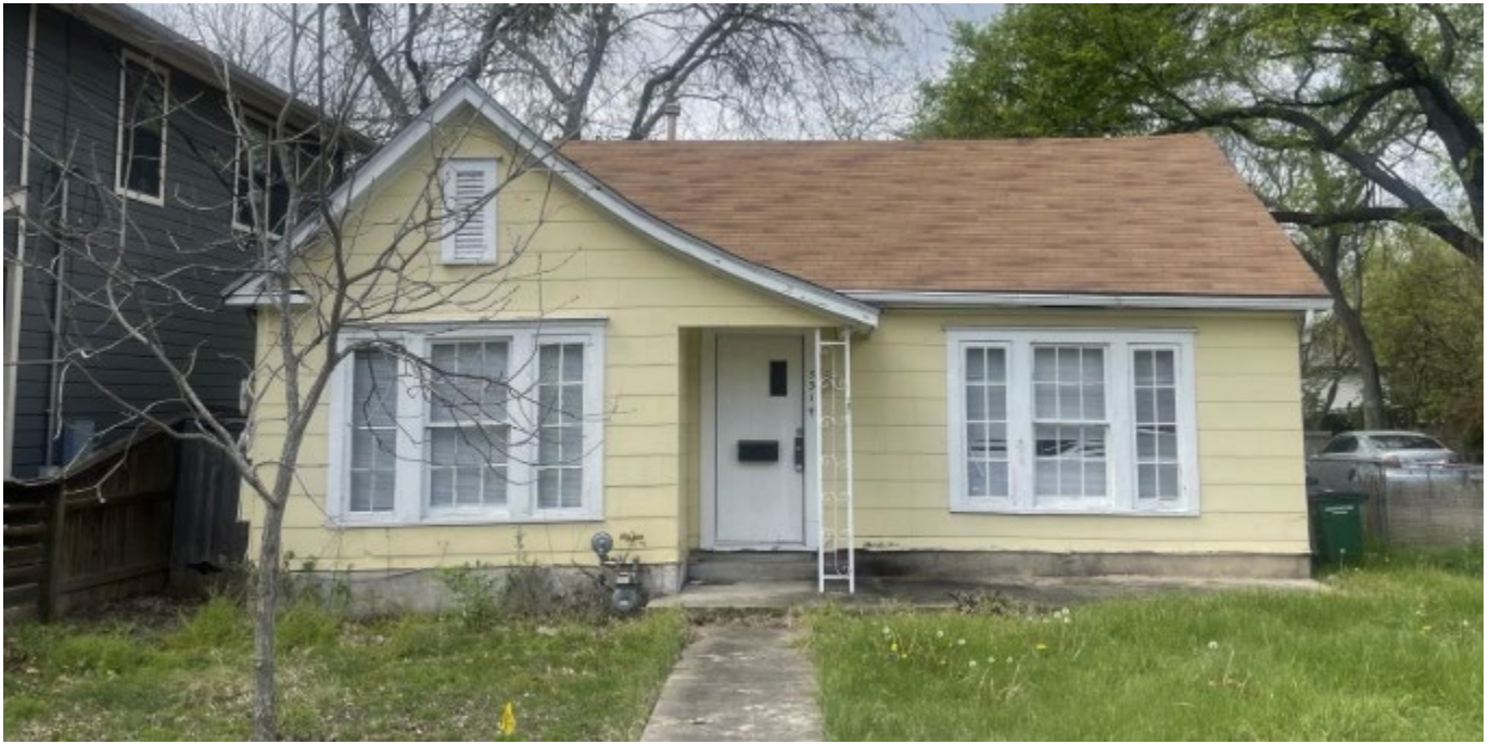
Demolition permit application, 2024