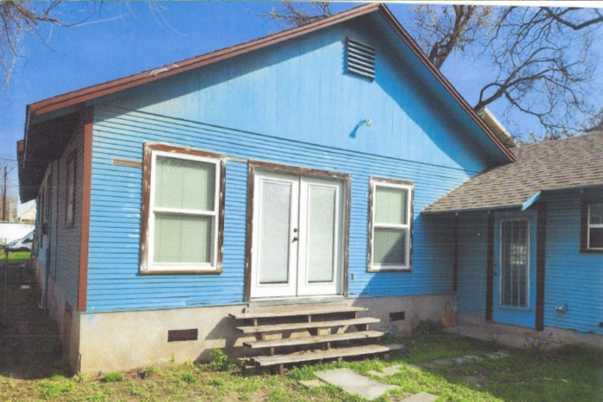
Demolition permit application, 2024