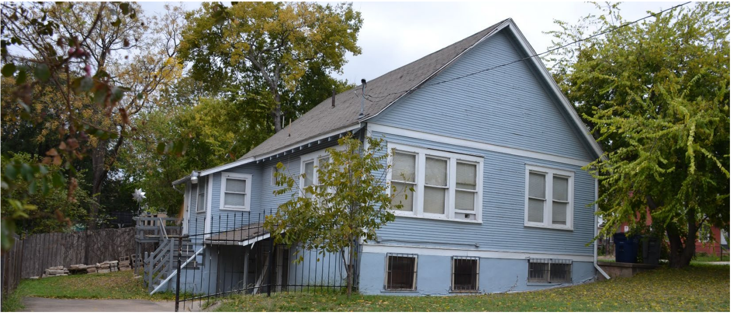
North Central survey, HHM Inc., 2020