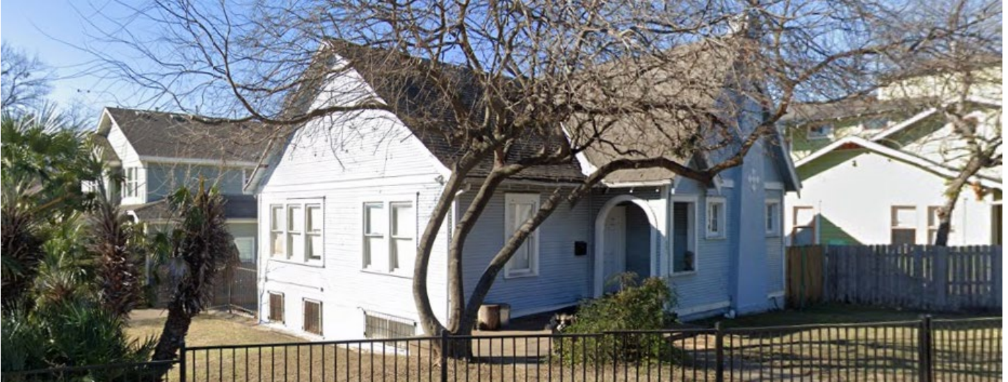
Google Street View, 2023