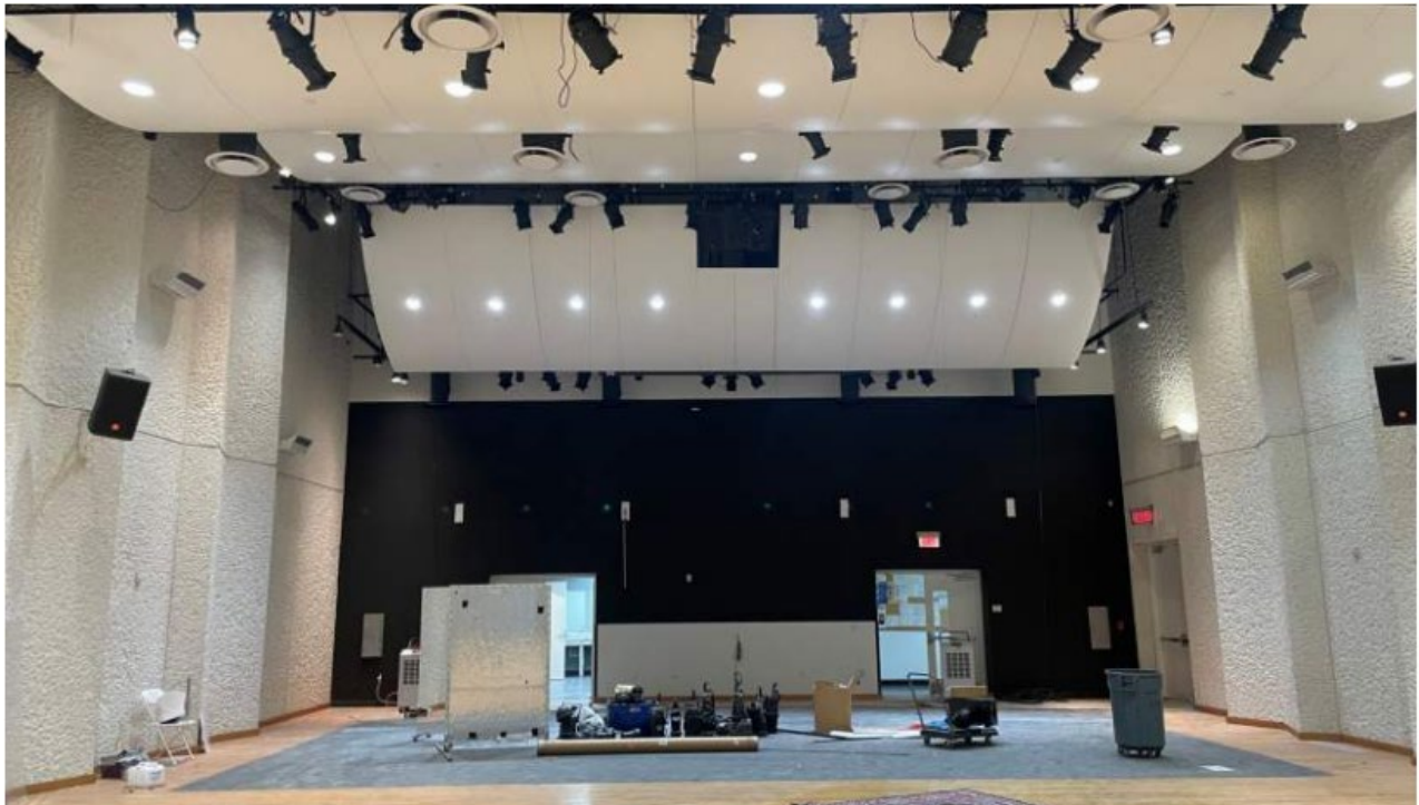
Main Building: Demolition of auditorium sound shell.