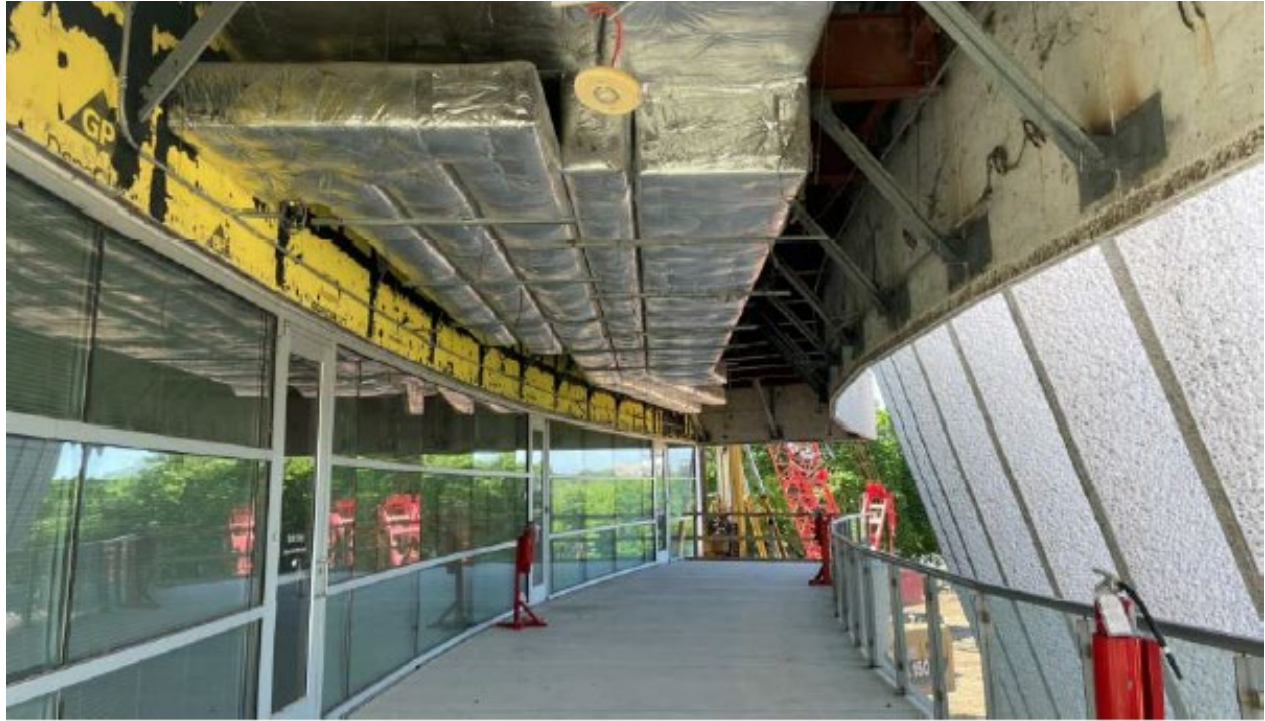
Main Building: Exterior metal soffit (ceiling) has been removed.