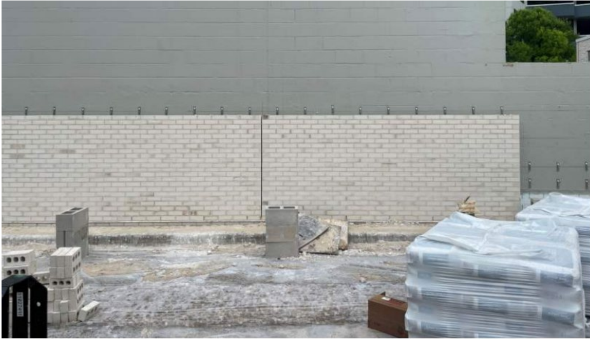
Central Utility Plant (CUP): Brick installation in progress.