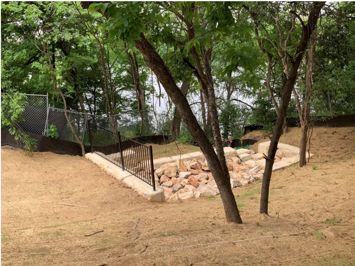
Site: Lady Bird Lake stormwater outfall with vegetative mats installed.