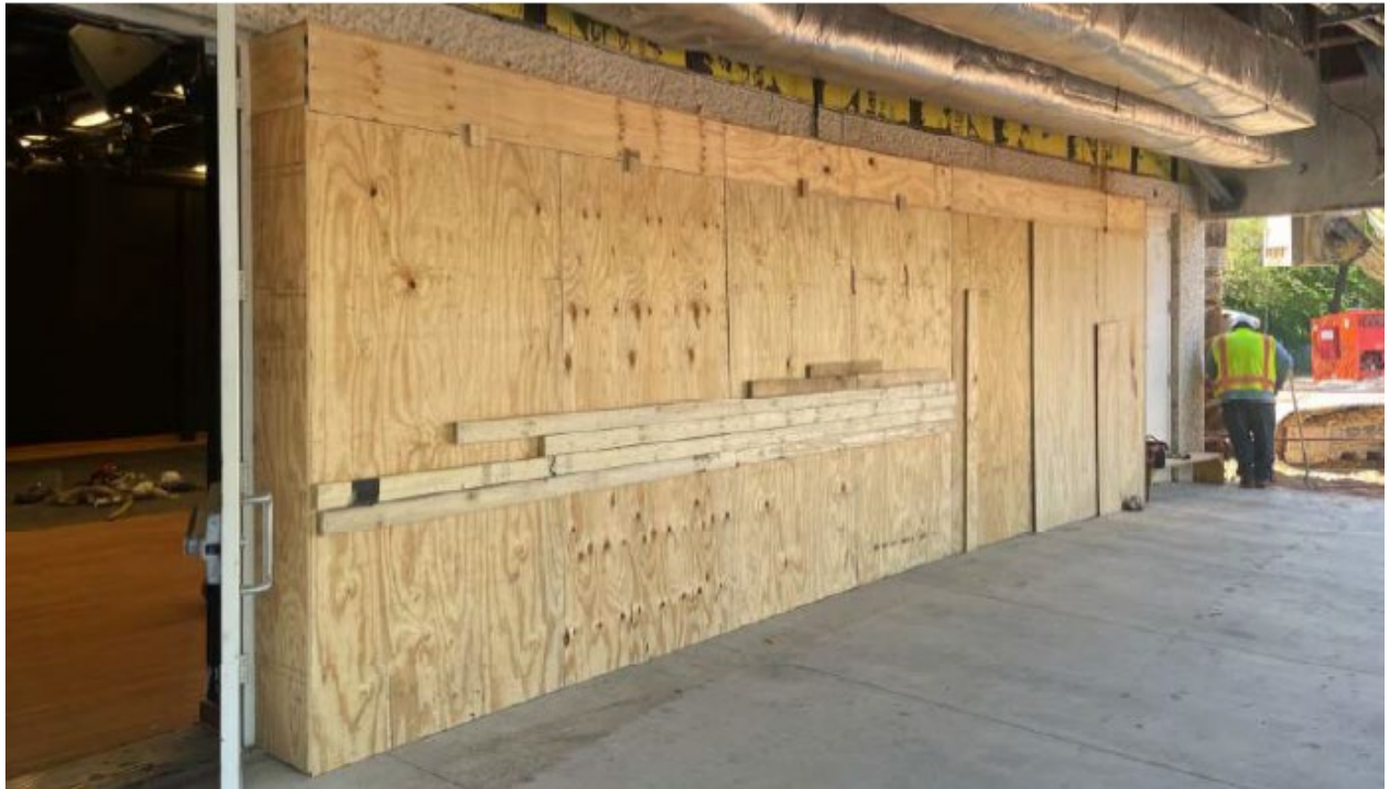
Main Building: Level 1 protection in place for "Petalos" wall.