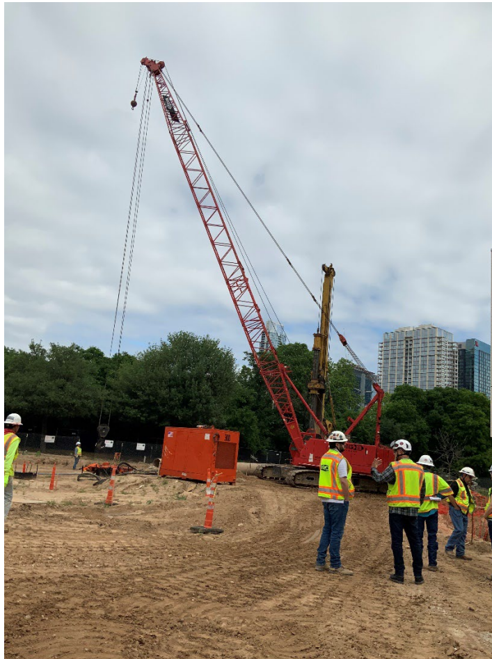
Main Building Expansion (North): Foundation work has begun with drill piers.

For project updates, visit the project website: www.austintexas.gov/MaccPhase2