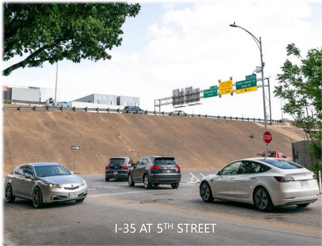
I-35 AT 5 TH STREET