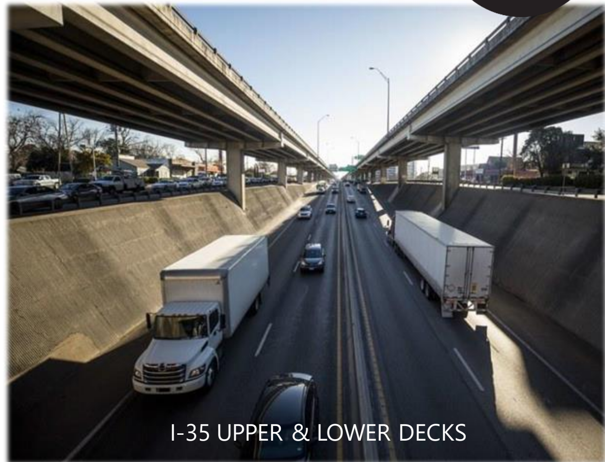
I-35 UPPER & LOWER DECKS