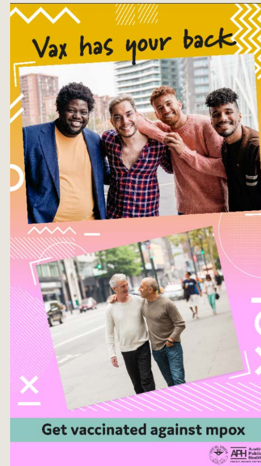
An Example of an Instagram story post