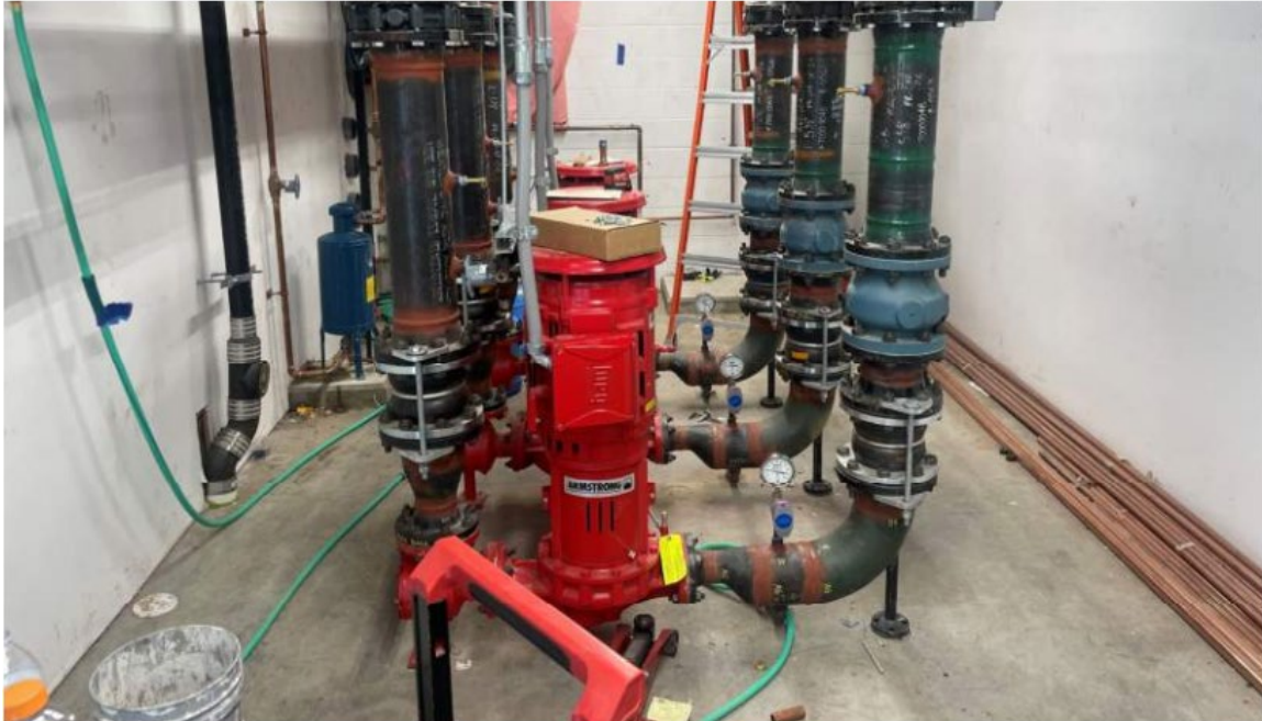
Central Utility Plant (CUP), Pump Room: Pumps installed.

For project updates, visit the project website: www.austintexas.gov/MaccPhase2