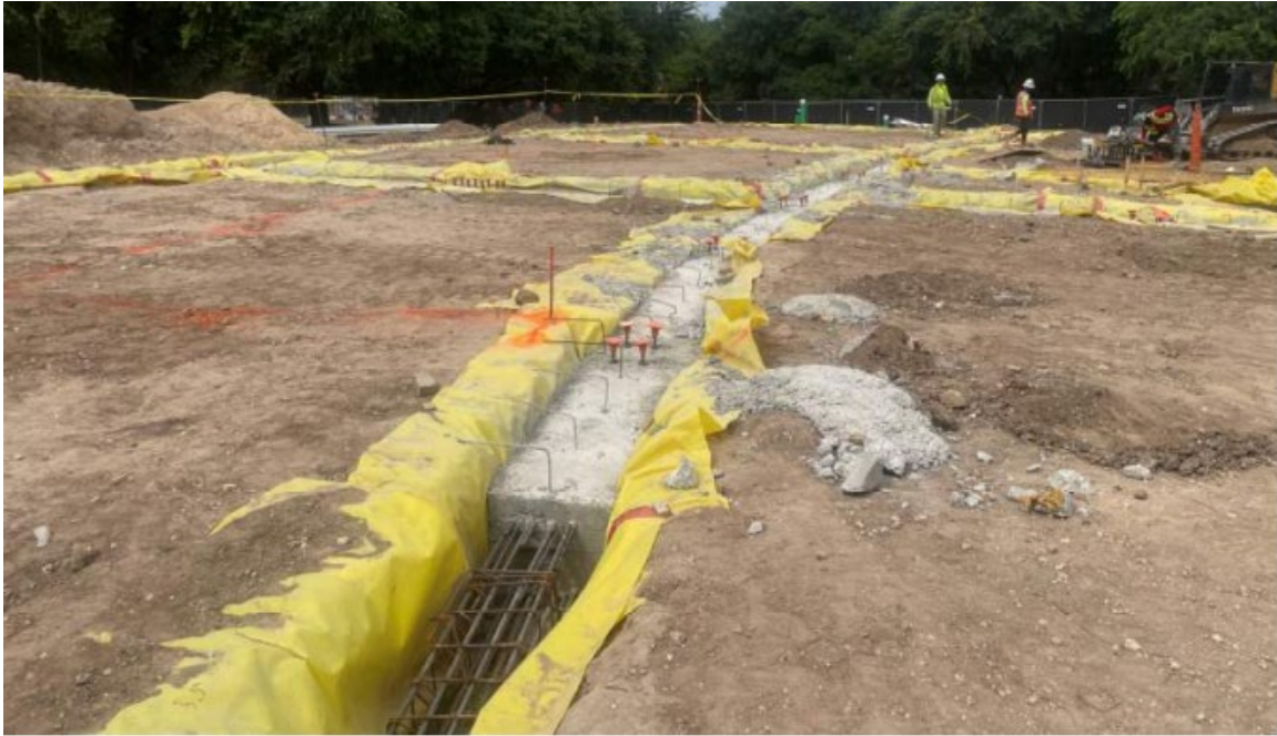
Building Addition: Concrete for grade beams and steel reinforcement partially poured.