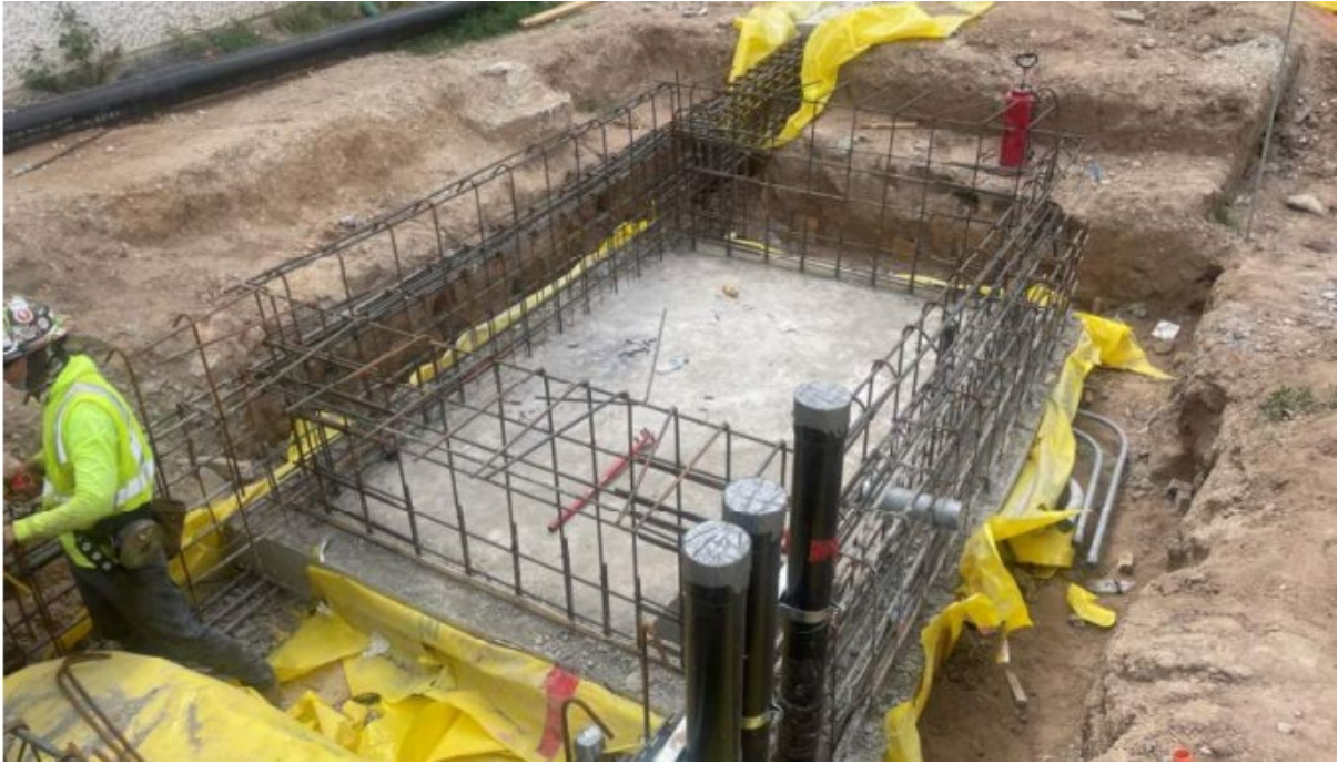
Building Addition: Concrete for elevator pit slab poured.