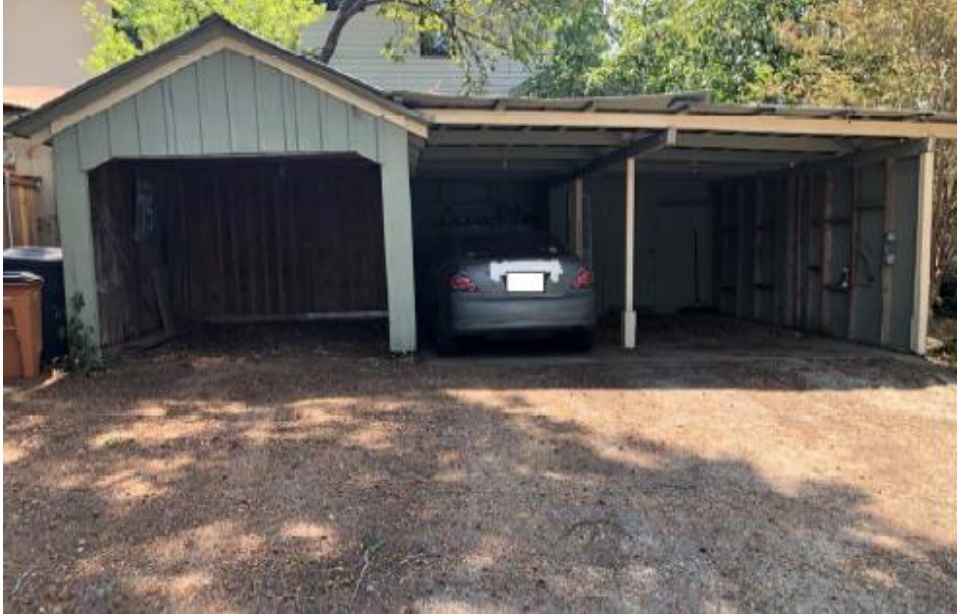
Previously approved demolition application, 2024