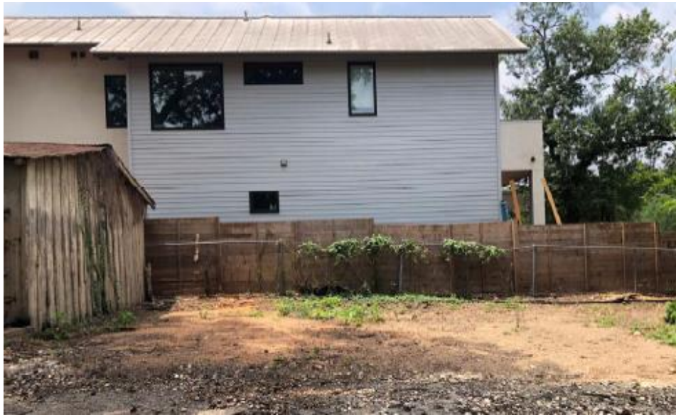
Current view, application, 2024