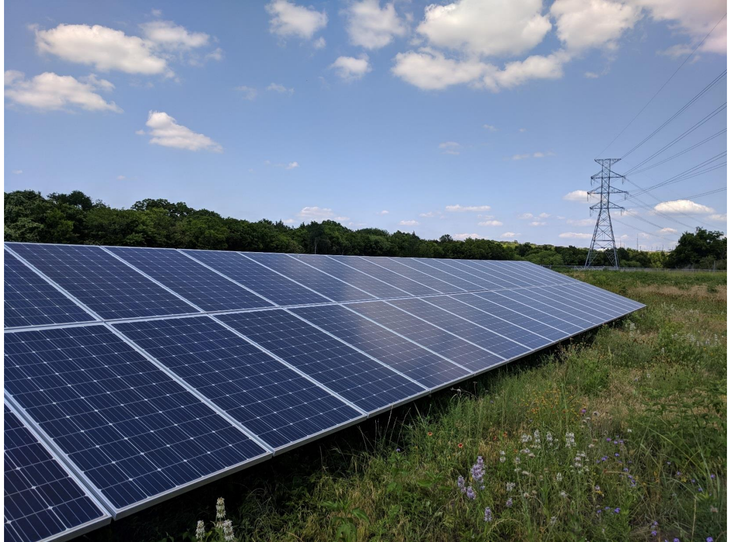
La Loma Community Solar Farm