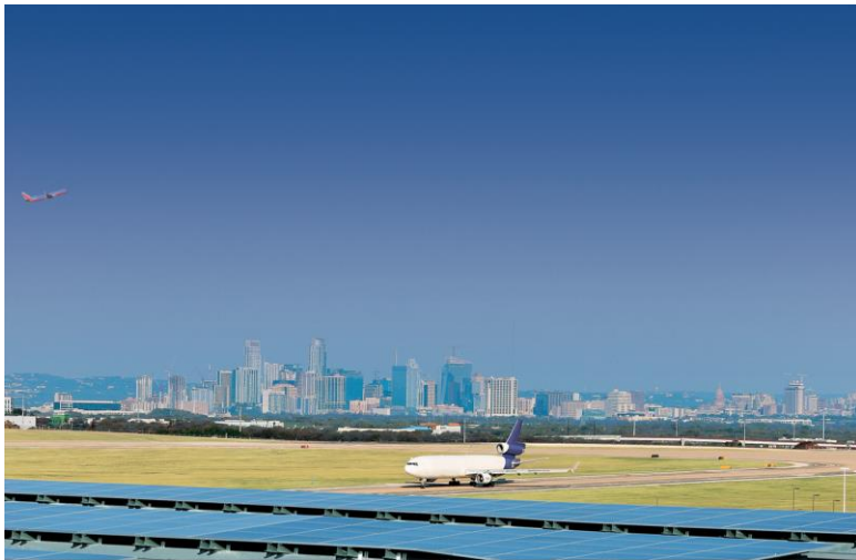
AUS Blue Garage Carports