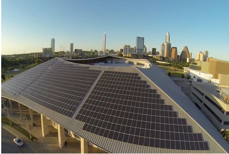
Palmer Event Center