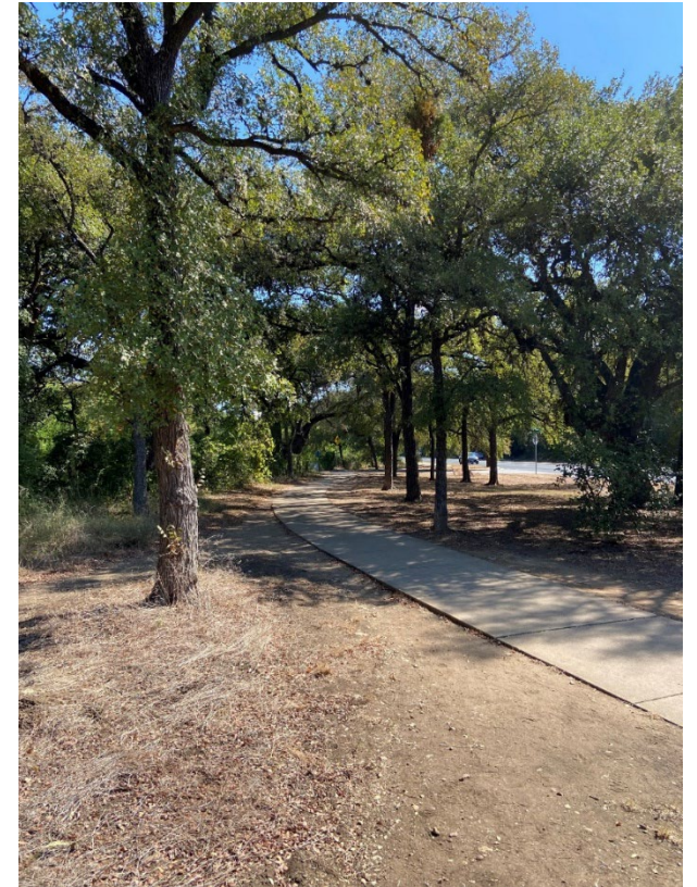
Old 5' wide sidewalk