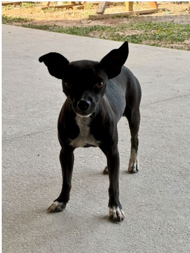
"Taco": MACC resident has found a loving adoptive family.