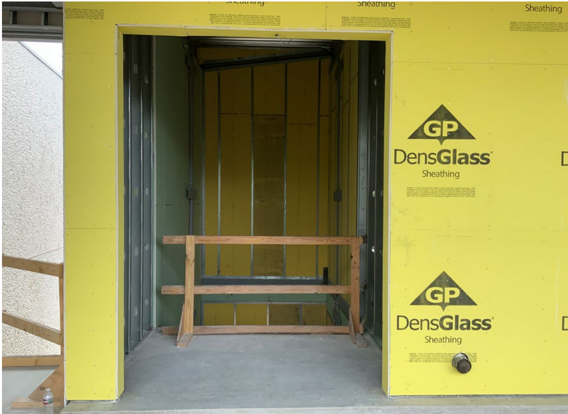
South Addition: Elevator shaft and vestibule framed.