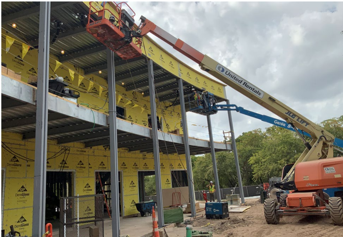
South Addition: Exterior waterproofing sheathing installed.