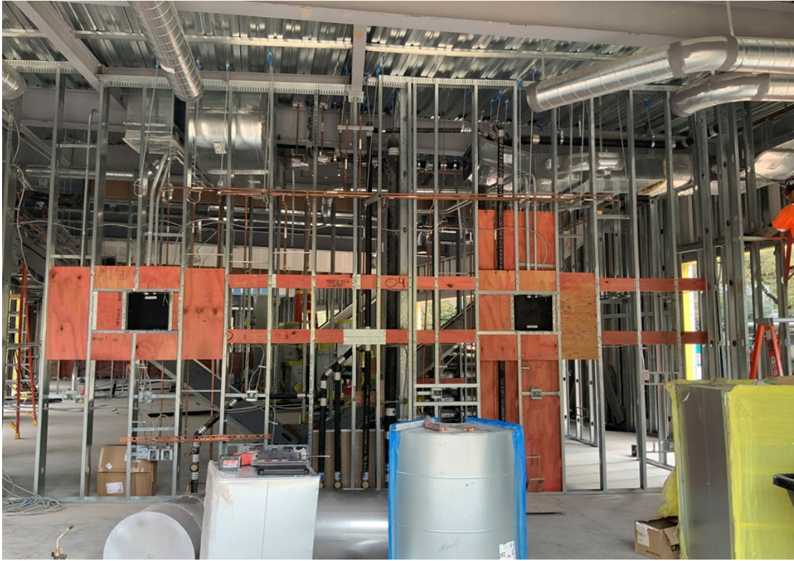
South Addition: Teaching kitchen wall framed and overhead rough-in ducting hung.