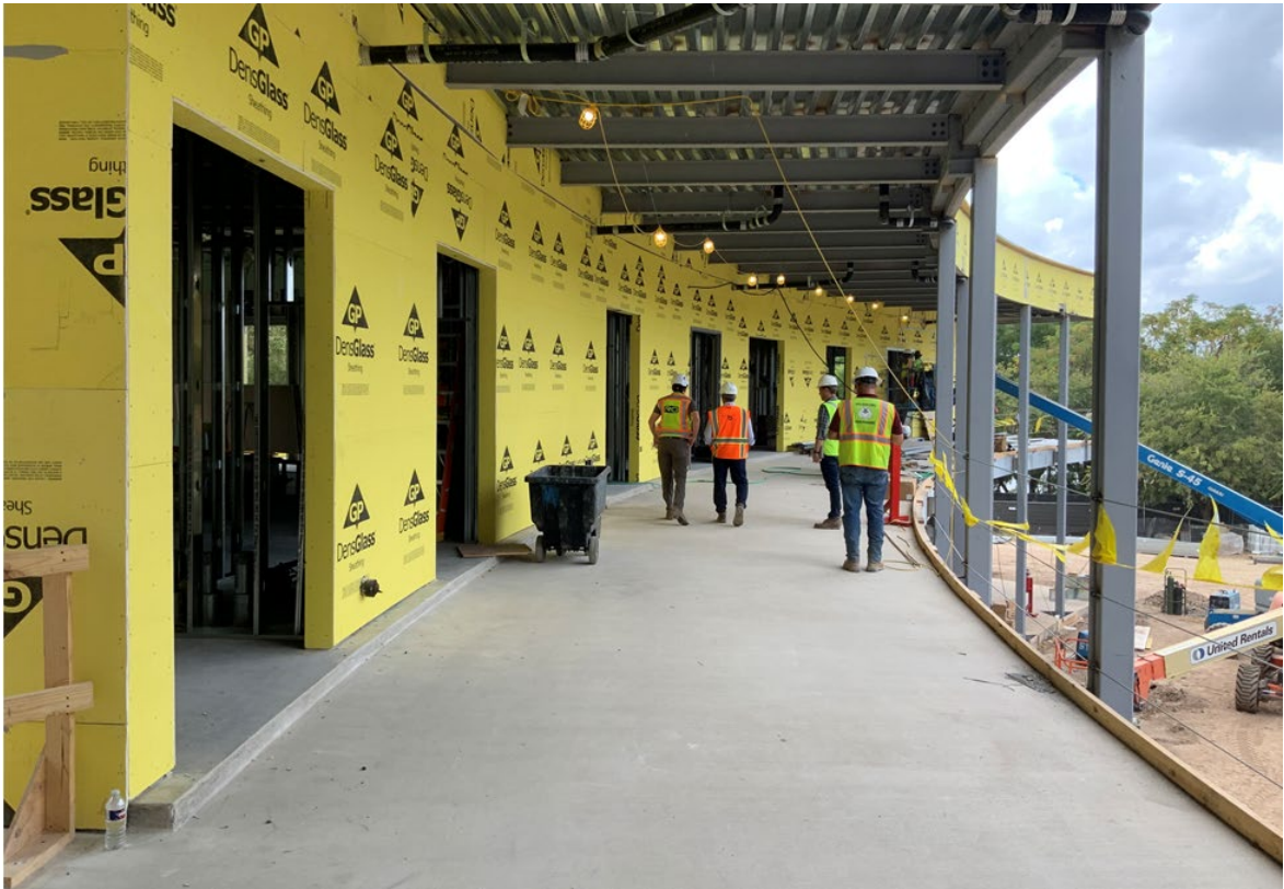
South Addition: View of level 2 exterior walkway with exterior wall sheathing applied.