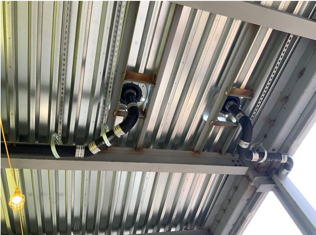
North Addition: Roof drains roughed in.