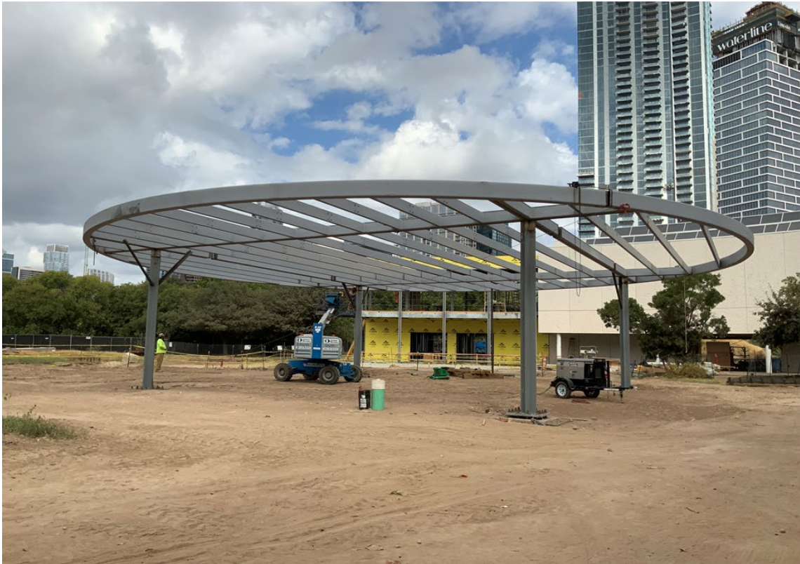
Zocalo: Shade structure erection in progress