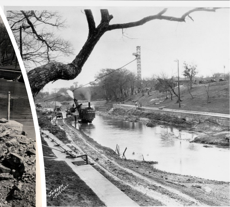
Center